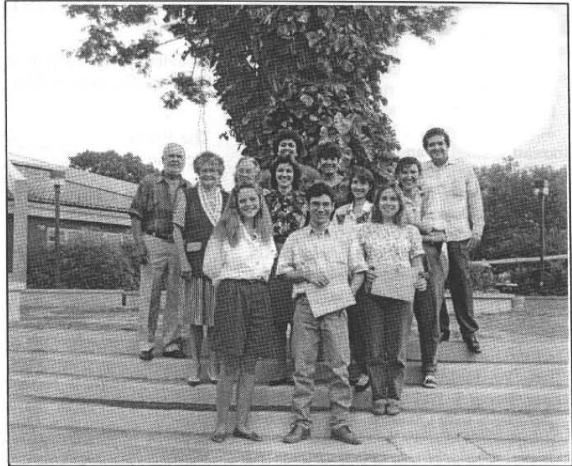
A group of 1992 volunteers attended STRI's appreciation ceremony held on Friday, July 30. Last year 35 volunteers contributed valuable time to STRI research, education and support activities •••Un grupo de voluntarios de 1992 asistieron a la ceremonia de agradecimiento el viernes 30 de julio. El año pasado 35 voluntarios contribuyeron con su valioso tiempo a la investigación, educación y actividades de apoyo de STRI.

The Interamerican Institute of Tourism offers its second course of the Specialized Cycle on Ecotourism Development and