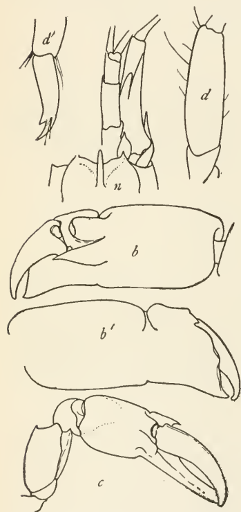
FIG. 1.—ALPHEUS CANDEI. b. INFERO-EXTERNAL SURFACE OF LARGE CHELA. b'. SUPERO-INTERNAL SURFACE OF LARGE CHELA. c. SMALL CHELA. d. MEROPODITE OF THIRD FOOT. d'. DACTYL OF FIFTH FOOT. n. ANTERIOR REGION.

Guérin's type was from Cuba. The figure and description which he gives, although insufficient, apply to the specimens from Tortugas with singular accuracy. The form of the frontal border, sinuous between the spinous orbital arches and the rostrum, the proportion of the articles of the antennule, the stylocerite, the spine of the basicerite, the relative proportions of the two pairs of antennæ, of the carpo-cerite and of the scaphocerite; all these details agree with the figure and the description of A. candei . The stylocerite is, however, a little shorter in the specimens from Tortugas. In the drawing by Guérin the scale of the scaphocerite is not distinct, but this inaccuracy may be explained by the long slender form of the scale, the internal border of which is in the prolongation of the strong lateral spine.