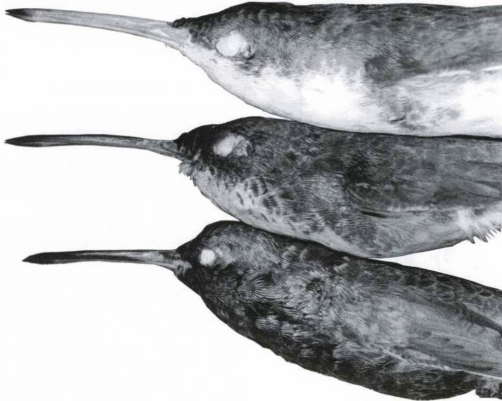
Fig. 1. Lateral views of males in definitive plumage: Amazilia violiceps ellioti (top), Cynanthus latirostris magicus (bottom), and a probable hybrid, Amazilia violiceps ellioti × Cynanthus latirostris magicus (= type of Cyanomyia salvini Brewster, 1893; MCZ 224,124).

order to reduce measurement variation, I held the aperture flush with the rectrix surface without depressing it. The default setting for the CR-221 Chroma Meter displays mean values derived from three sequential, in situ measurements. I repeated this procedure twice (five times for the type of Cyanomyia salvini ), removing the aperture between trials. Thus, each datum summarized in Table 2 represents the mean of 6 (parental species) or 15 (type of C. salvini ) independent colorimetric measurements.