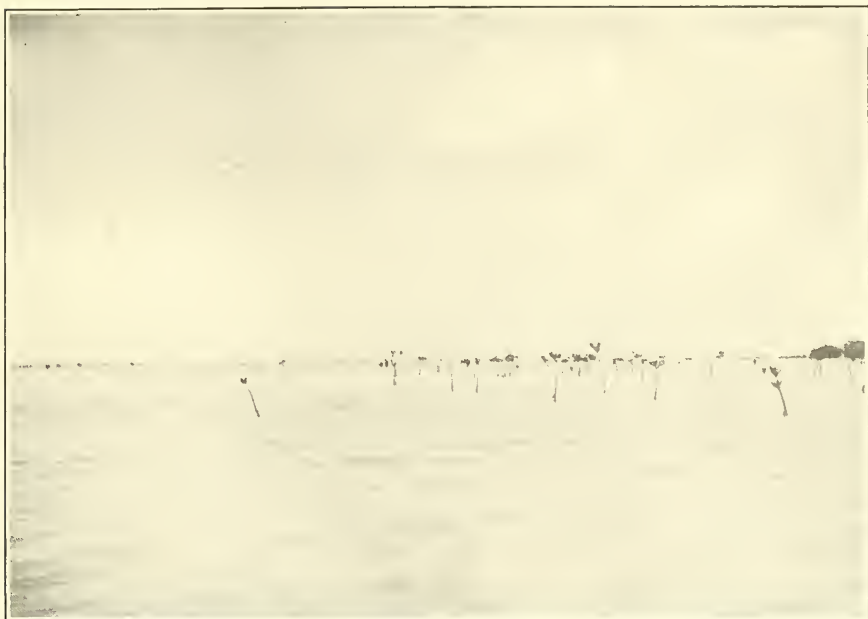
Fig. 1.--YOUNG MANGROVES ON SHOAL, UPPER END OF LONG ISLAND, WATER ABOUT ONE FOOT DEEP