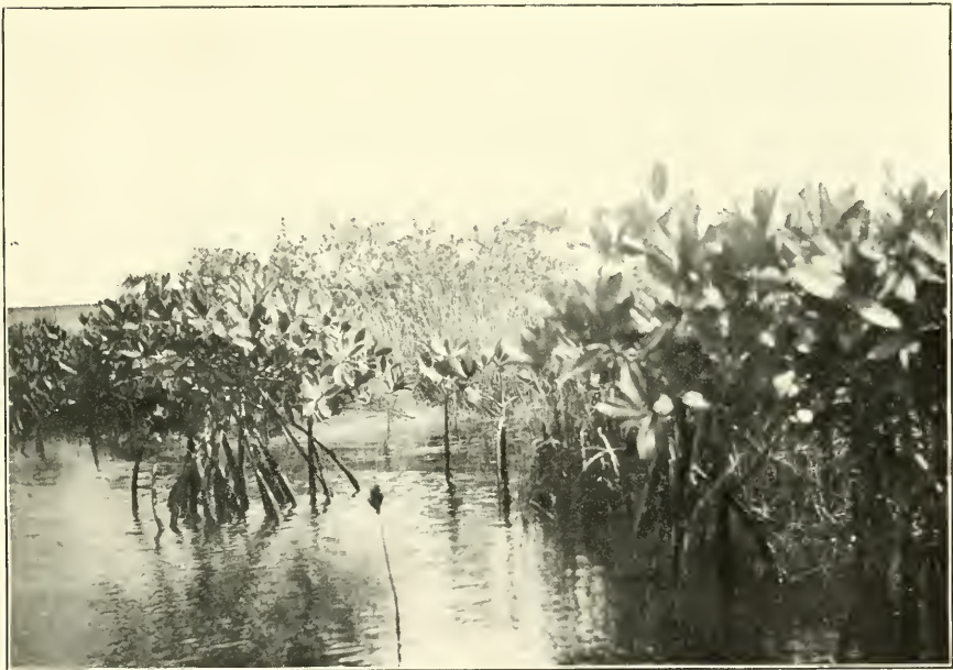
Fig. 2.--YOUNG MANGROVES ALONG NORTH BANK OF MIAMI RIVER MIAMI