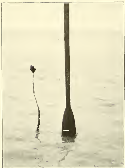
Fig. 2.--YOUNG MANGROVE ON SHOAL TWO MILES NORTHEAST OF PIGEON KEY, WATER ABOUT ONE FOOT DEEP