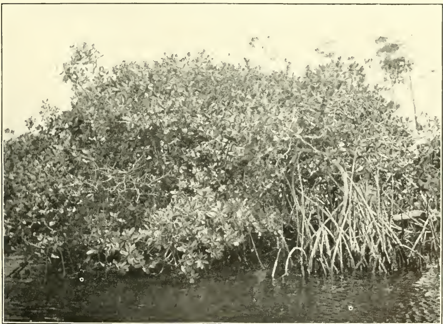
Fig. 2.--ADULT MANGROVES ALONG NORTH BANK OF MIAMI RIVER MIAMI