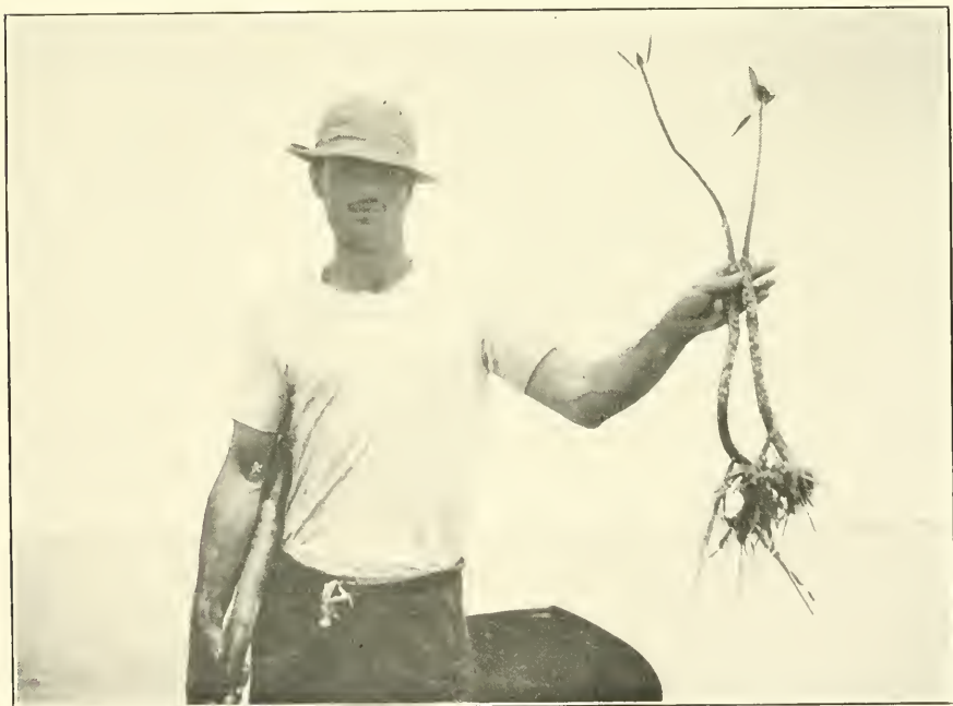
Fig. 3.--TWO YOUNG MANGROVES FROM SHOAL ABOUT TWO MILES NORTH OF PIGEON KEY WATER ABOUT ONE FOOT DEEP