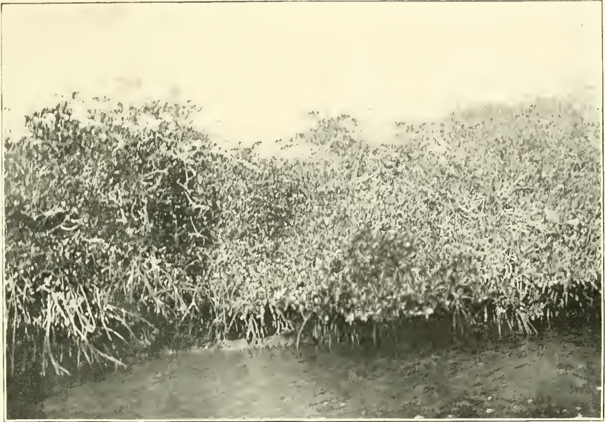
Fig. 1.--MIAMI RIVER BETWEEN MIAMI AND THE EDGE OF THE EVERGLADES