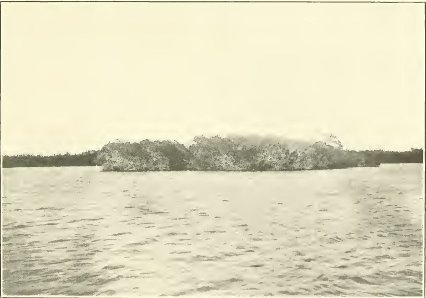
Fig. 2.--MANGROVE KEY, BETWEEN LARGO AND OLD RHODES KEYS