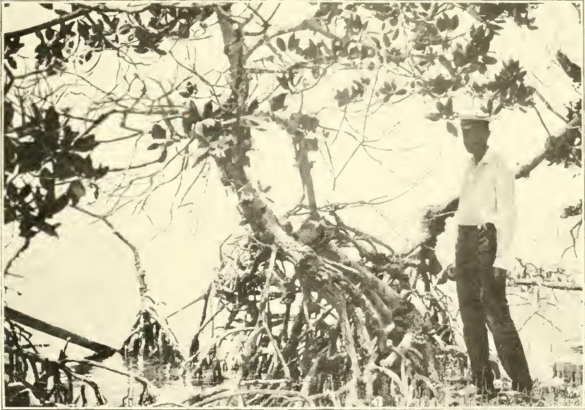
Fig. 1.--MANGROVE ROOTS AT PIGEON KEY