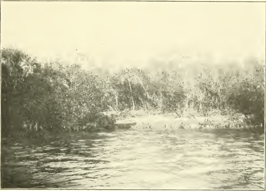
Fig. 1.--ELEVATED CORAL REEF ROCK AND VEGETATION AT SOUTHERN END OF OLD RHODES KEY, DETACHED KEY