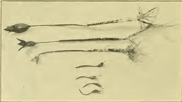
FIG. 79.—Mangrove fruit and young shoots. The four smaller specimens on left are fruit. About one-sixth natural size.