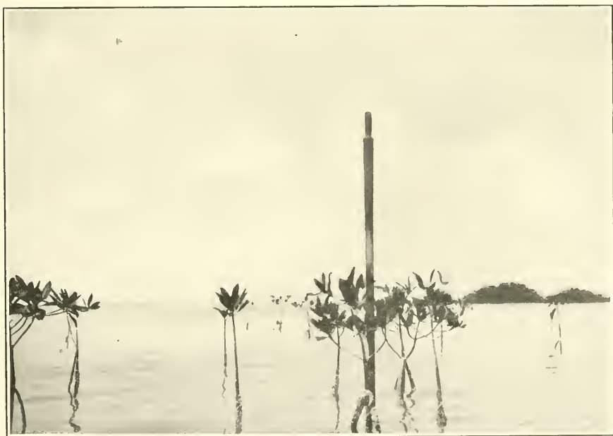
Fig. 2.--YOUNG MANGROVES, OAR BY THEIR SIDE. NEAR VIEW SAME LOCALITY