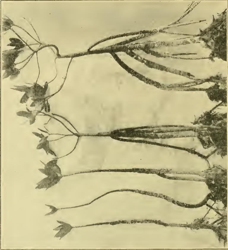
FIG. 80.—Young Mangroves. About one-sixth natural size.