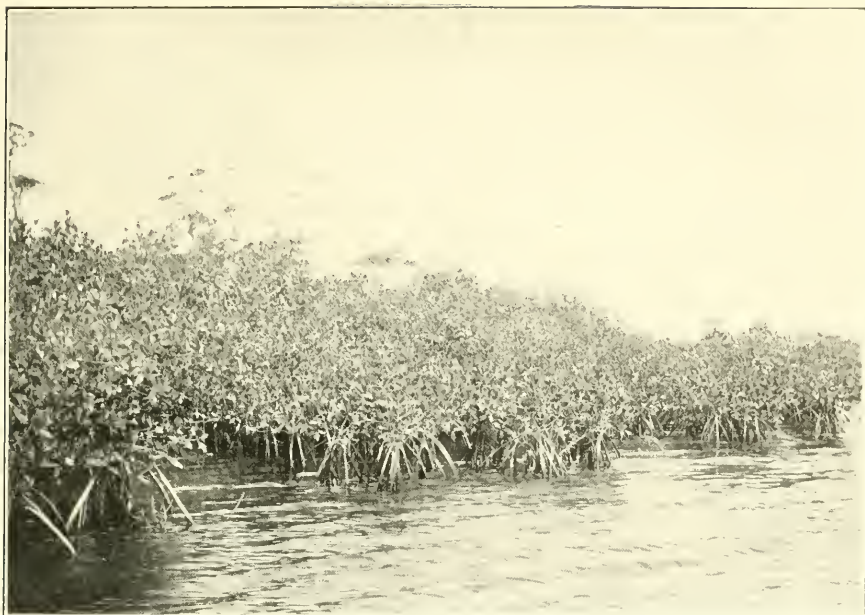
Fig. 1.--MANGROVES ALONG SOUTH BANK OF MIAMI RIVER, MIAMI