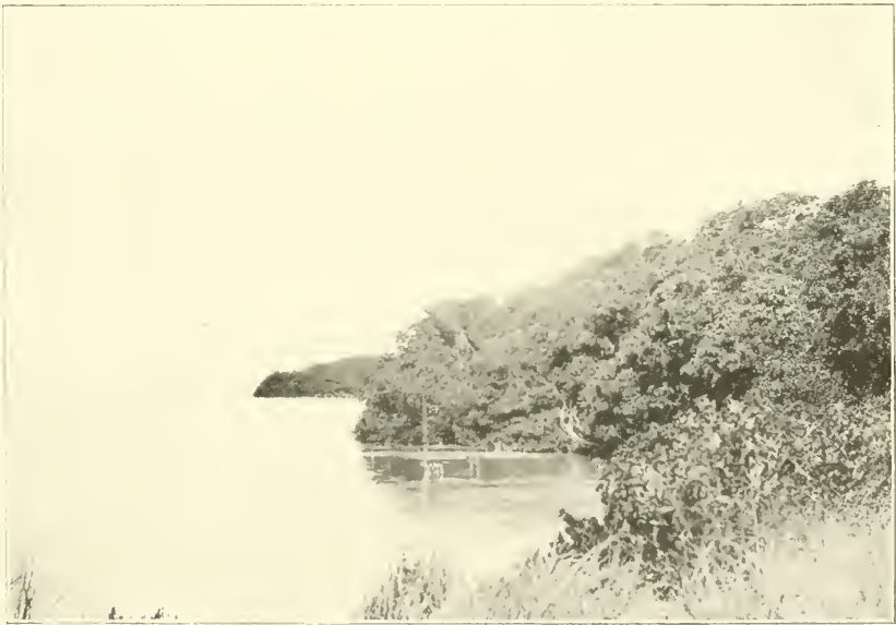
Fig. 2.--MANGROVES ALONG THE SOUTH SHORE OF THE MARQUESAS