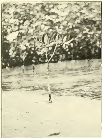
Fig. 1.--YOUNG MANGROVE ON SOUTHWEST SIDE OF BEAR CUT, NORTHWEST POINT, BAY BISCAIYNE