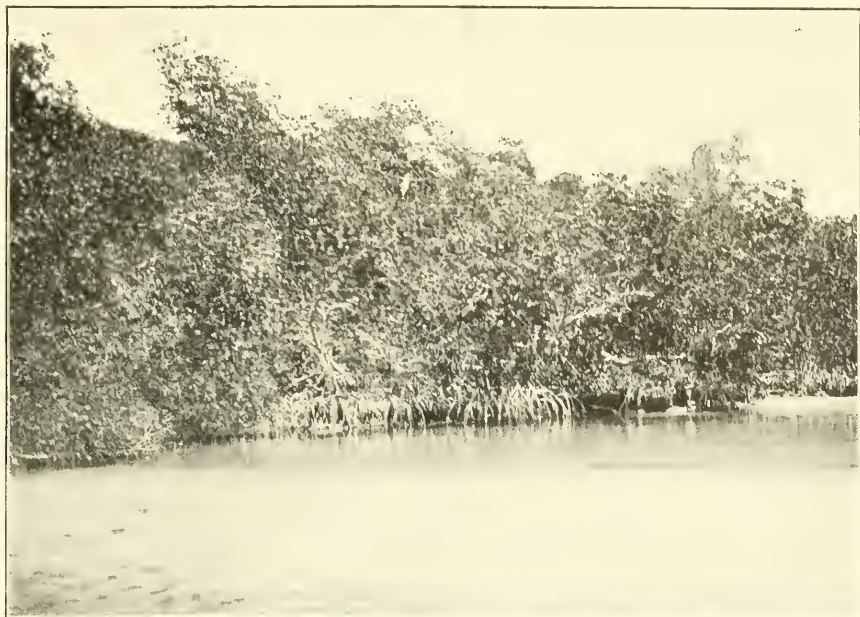
Fig. 1.--MANGROVES AT NEW CUT, EASTERN SIDE OF BISCAYNE BAY, OPPOSITE MIAMI