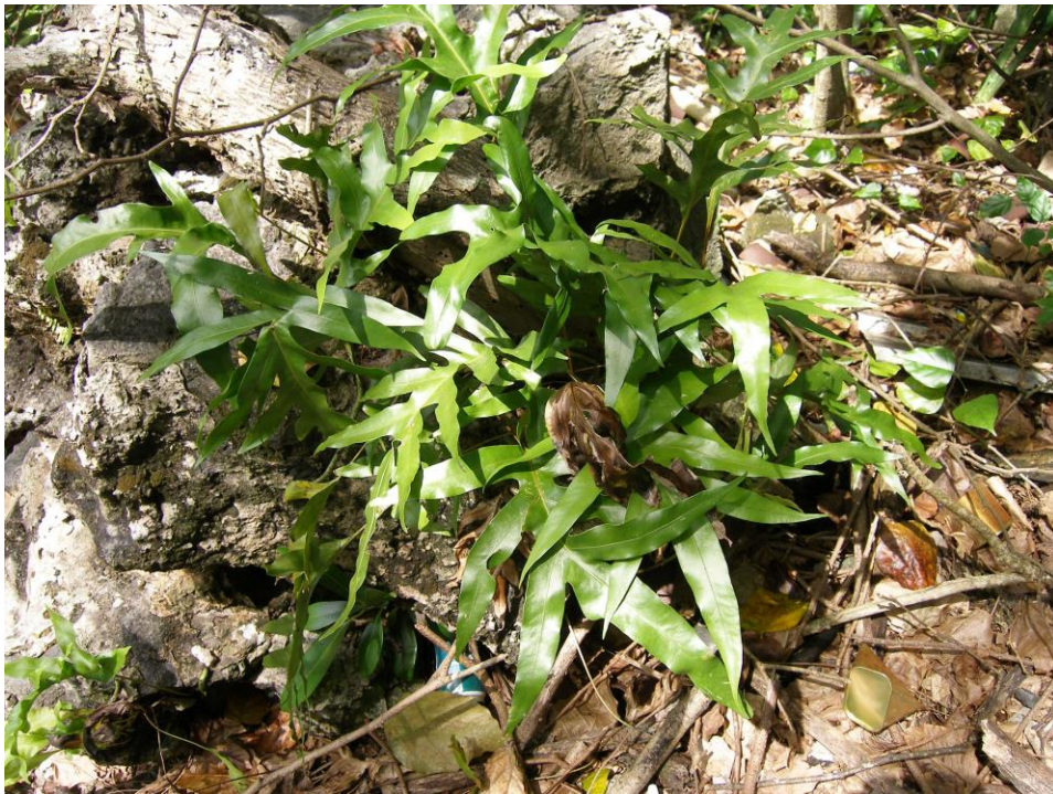
Figure 19. The fragrant fern te keang ni Makin Microsorium grossum , common in understory vegetation in open and open-shaded sties.