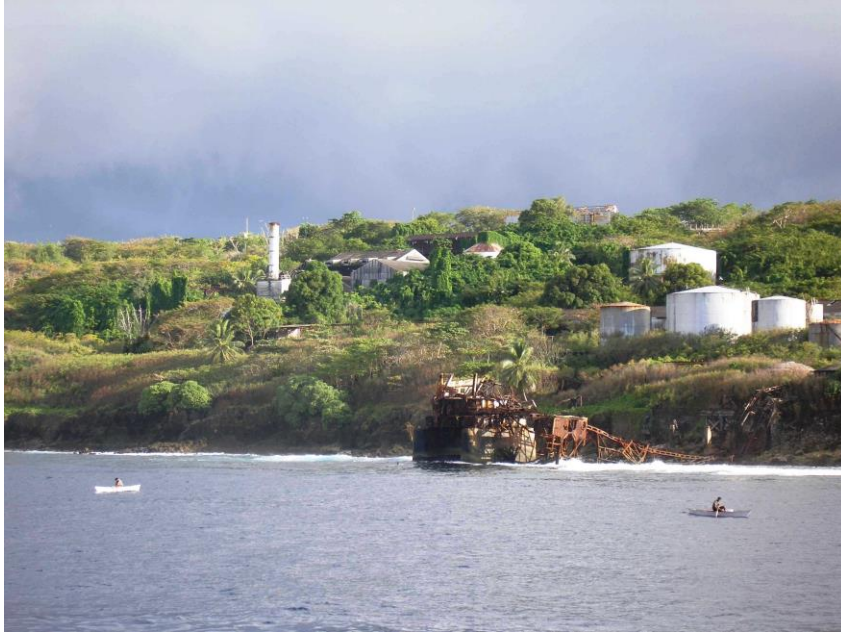
Figure 5. View of Banaba from the ocean off Home Bay showing the vegetation and the coastal limestone terraces, cliffs and escarpment rising to the central upland. Phosphate mining infrastructure remains, including the rusting cantilever used to load phosphate ships during the time of mining.