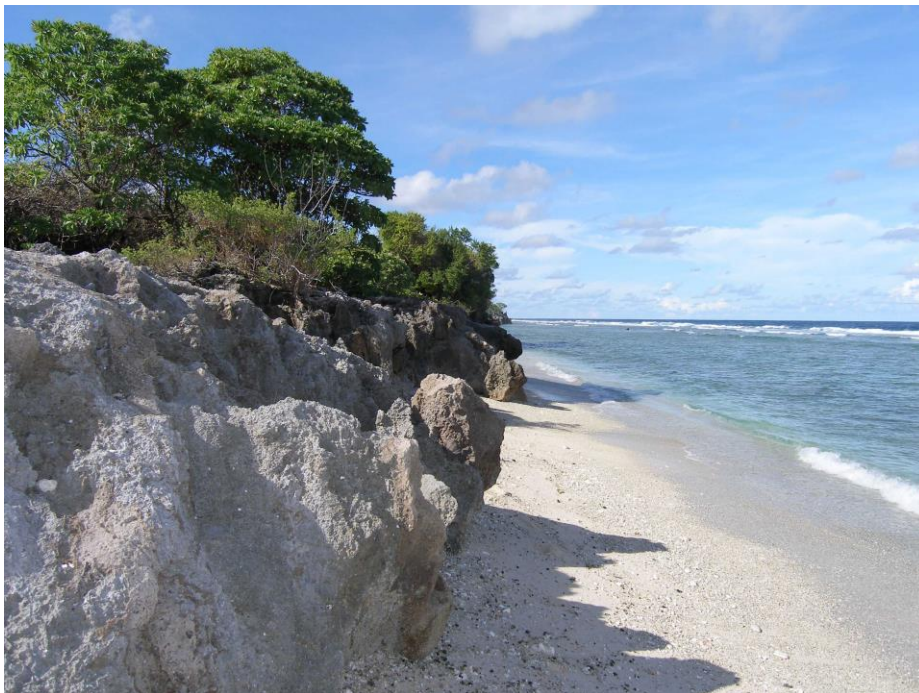
Figure 15. Uplifted limestone terraces and coastal vegetation dominated by te ngea ( Pemphis acidula ) and te ren ( Tournefortia argentea ) encircled by a subtidal fringing reef in the Uma area on the southeast coast of Banaba.