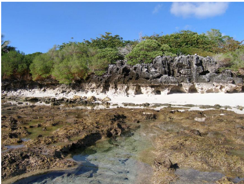
Figure 6. Intertidal flat and wave-cut limestone coastal terraces and coastal vegetation on north coast of Banaba.

The central upland inland from the cliffs consists of coral-limestone pinnacles and limestone outcrops, between which extensive deposits of soil and high-grade tricalcic phosphate rock used to be found before the long history of mining (Viviani 1970; Tyrer 1962; Taylor 2005).