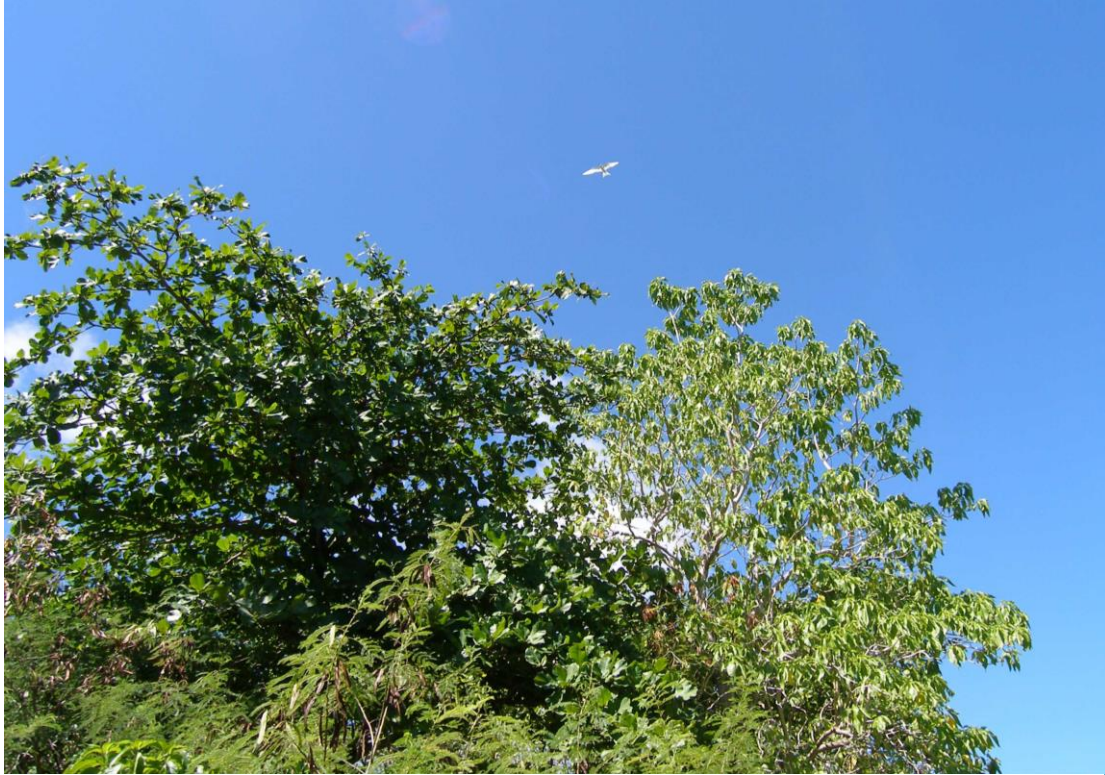
Figure 16. Remnant Terminalia catappa te kunikun and Pisonia grandis te buka forest in unmined area near Tabwewa inland from the north coast of Banaba.

Based on the small stands and remnant individual trees still found in the interior of the island on “topside” and similar studies of unmined forest on Nauru, the dominant upper canopy tree species of the central inland forest and woodland are te itai Calophyllum inophyllum (Figure 17), te kunikun Terminalia catappa , and possibly Millettia pinnata , which is very common in unmined areas around the Sports Ground (Figure 3) and the hand-mined areas to the northeast of Fatima. Also occasional as an emergent tree is te buka Pisonia grandis . Also possibly present as a component of this vegetation type in the past was the native banyan, te aiao Ficus prolixa , which was only seen on the margins of the settlement and in some of the mined areas in 2005, but was a common component, especially on emergent limestone pinnacles in Nauru (Thaman et al. 1994; Thaman et al. 2008a, 2008b).