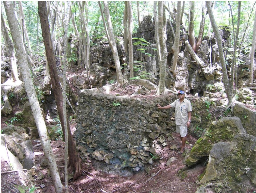
Figure 21. Malosi Samuelu in a stand of Delonix regia in mined-out area near an old well ( bangabanga ) near Tabiang Settlement.