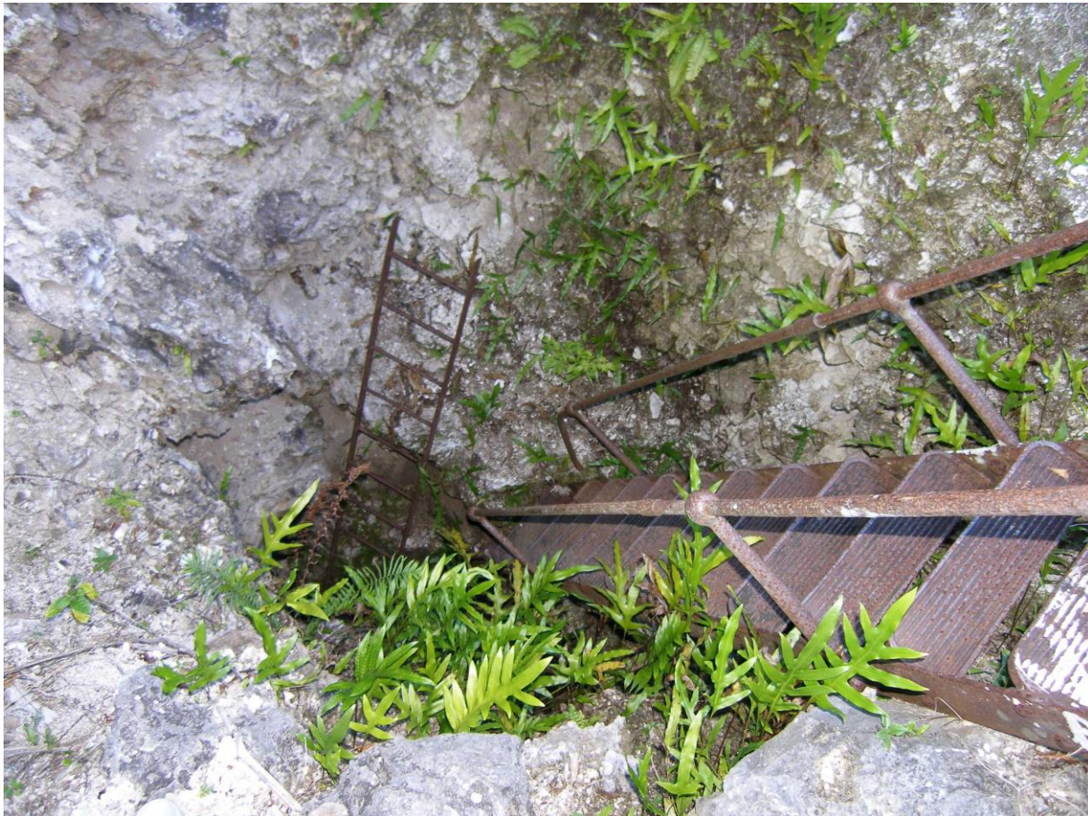
Figure 7. Entrance to an active well or water cave ( bwangabwanga ) with Microsorium grossum te keang ni Makin growing on the walls inland from stock pile on Topside of Banaba.

Although no technical reports are available, we observed the soils of Banaba, like those of Nauru, to be shallow, coarse-textured, presumably alkaline, and of carbonatic mineralogy. They are composed of a variable layer of organic matter and coral sand, gravel and fragments overlaying a limestone platform. Potassium levels are often extremely low, and pH values of up to 8.2 to 8.9 and high CaCO 3 levels make scarce trace elements, particularly iron (Fe), manganese (Mn), copper (Cu) and zinc (Zn), unavailable to plants. Calcium dominates the exchange complex and exchangeable magnesium is also high, while extractable phosphate values are generally high and sulphate moderate. Fertility is, therefore, highly dependent on organic matter for the concentration and recycling of plant nutrients, lowering soil pH, and for water retention in the excessively well-drained soils (Morrison 1987, 1994).