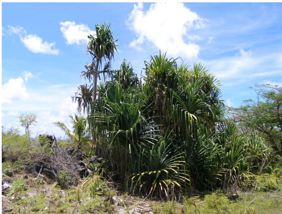
Figure 9. Planted edible pandanus te kaina Pandanus cultivar on land south of the cemetery (see Figure 3). Pandanus trees, coconut palms and other useful trees were traditionally gifted or inherited with land in Banaba.