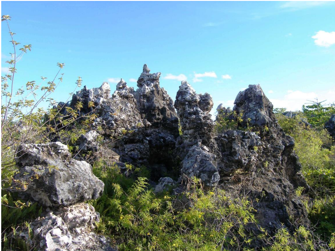
Figure 10. Sparsely vegetated impoverished pit-and-pinnacle moonscape in a mined out area of central Banaba showing little regeneration of original vegetation over forty years since the cessation of mining.

At the time of our visit to Banaba in 2005, the resident population was reportedly 301 (dropping to 295 in 2010). Of these 165 were Banaban, 125 from other islands of Kiribati and 5 from other Pacific Islands (Office of Te Beretitenti 2012). All were reportedly living mainly in three villages (Tabwewa, Antereen [also called Tabiang], and Uma), located along the coast and accessed by a modern coal tar road. A fourth village, Buakonikai (Te Aonoanne) “has been totally mined out leaving a mere plot amidst the rising pinnacles” (MISA 2008). There is no airstrip on the island and no scheduled boat service, with highly irregular transport to and from Banaba by charter vessel. When ships fail to arrive, the island runs short of imported foodstuffs, such as rice, sugar and flour, and other essential supplies including fuel. Finally, although still very attached to their ancestral homeland, most people of Banaban descent now live on Rabi in the Fiji Islands, where in 2010 the population was over 5,000 people who speak the Kiribati language and hold both Fiji and Kiribati passports. There are also 173 and 45 people from Banaba living on South Tarawa or other islands of Kiribati, respectively (Office of Te Beretitenti 2012).