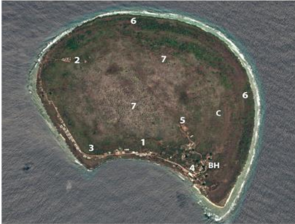
Figure 3. Map of Banaba showing (1) the main areas of settlement in the south and west of the island; (2) Fatima Village inland from Tabwewa in the northwest; (3) Tabiang Village in the southwest; (4) abandoned phosphate mining infrastructure and Uma Village inland from the southeastern part of Home Bay; (5) the sports ground towards the southwest-central part of the island; (6) the uninhabited east and north coasts; and (7) the mined central and northern parts of the island. Banaba House is denoted as BH, the cemetery as C.