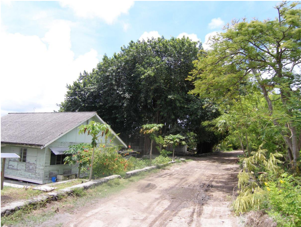
Figure 23. Scattered papaya trees ( Carica papaya ; on left of road), a spreading Indian banyan ( Ficus benghalensis ; center) and royal poinciana or flamboyant ( Delonix regia ; right) trees from the mining era in the main settlement of Tabiang, Banaba.

Other common ornamental and multipurpose plants such as coconut palms Cocos nucifera , frangipanis Plumeria spp. (Figure 24), papaya Carica papaya , common hibiscus Hibiscus rosa-sinensis , Indian mulberry Morinda citrifolia , yellow alder Turnera ulmifolia . Mexican lilac Gliricidia sepium are also common to occasional components of this vegetation type.