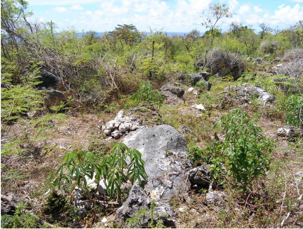
Figure 25. Cassava te tabioka Manihot esculenta , the main staple food crop planted in food gardens in the middle of the island south of cemetery.