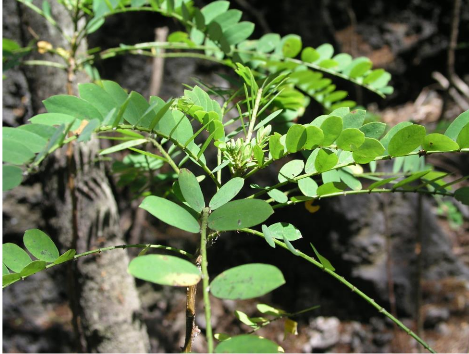
Figure 18. Small erect shrub, Phyllanthus societatis , a common understory species in inland forest and woodland on Banaba along path to the Chinese cemetery.