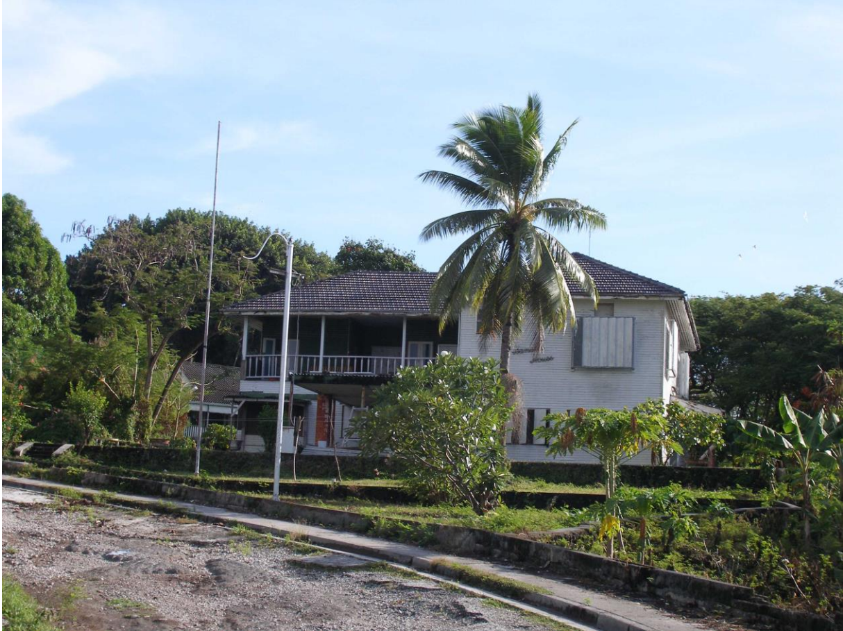
Figure 24. Coconut palm te ni Cocos nucifera , white frangipani te meria Plumeria obtusa , papayas and bananas ( Musa cultivars; in right foreground) at Banaba House.