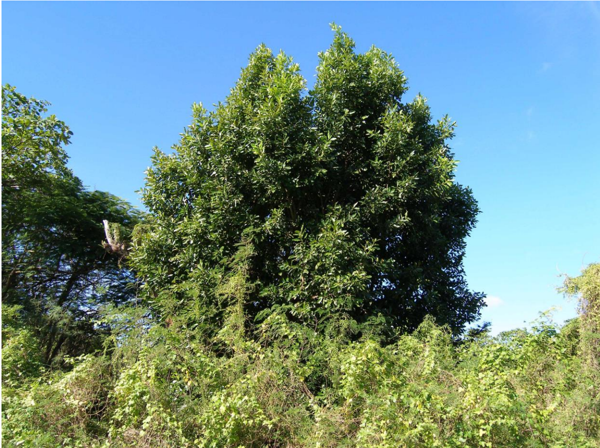
Figure 17. Calophyllum inophyllum te itai at the top of escarpment in mined area inland from the hospital. Formerly the dominant tree in the pre-mining inland forest of Banaba.

The dominant introduced plants include Leucaena leucocephala , Delonix regia and Tecoma stans (Figures 20 and 21). Uncommon is the occasional coconut palm, possibly deliberately or accidentally dispersed into these areas by local inhabitants. The Javanese flat sedge te titania Cyperus javanicus is uncommon on open sites in between limestone outcrops.