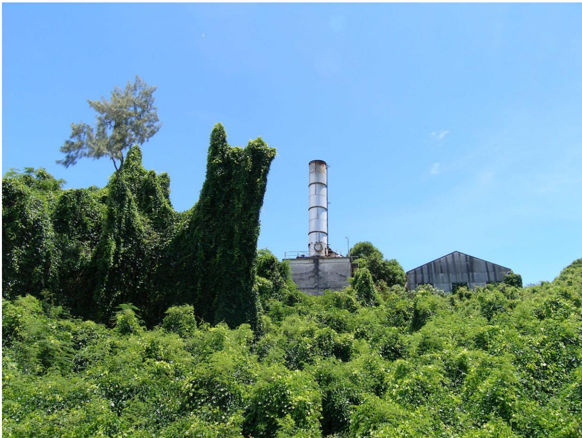
Figure 22. Indigenous high climbing vine Mucuna gigantea festooned over vegetation, including Casuarina equisetifolia trees, in the area of the abandoned calcination plant in the former mining settlement on Banaba.

One of the most distinctive, but variable, vegetation types is constituted by the houseyard and settlement gardens found in the settled areas around individual houses, in villages, around houses in the main settlement and near currently occupied housing, schools, churches and the hospital.