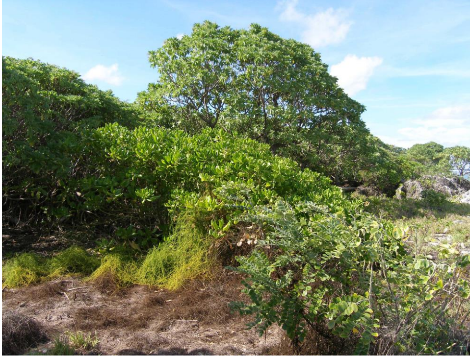
Figure 12. Sophora tomentosa (front right), Cassytha filiformis (front left), Scaevola taccada (center) and Tournefortia argentea (back) in coastal vegetation on coastal strip, Uma, southeast Banaba.