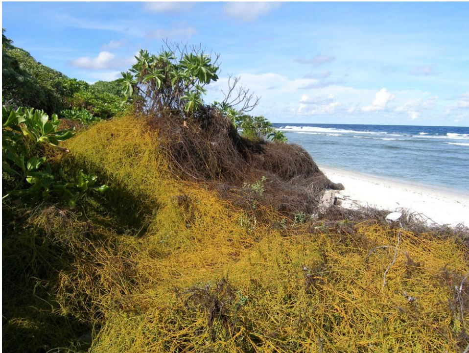
Figure 13. The leafless parasitic vine, Cassytha filiformis , spreading on coastal limestone and Scaevola taccada and Tournefortia argentea , Uma, southeastern Banaba.