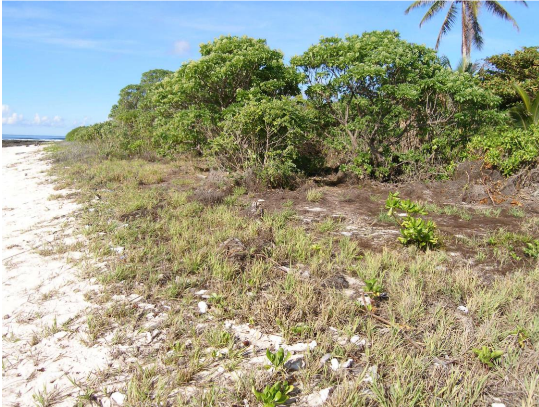
Figure 11. Coastal strand vegetation dominated by the grass Lepturus repens (foreground) and scattered Scaevola taccada shrubs and the taller Tournefortia argentea (background), Uma, southeastern Banaba.

The most common introduced species in this zone is leucaena te waiwai Leucaena leucocephala . Occasional species include pandanus te kaina Pandanus tectorius . A remnant individual te uri Guettarda speciosa tree, that had been severely cut, was seen on the inner margin of this zone in the southeast. The coconut palm te ni Cocos nucifera was conspicuously absent in this zone.