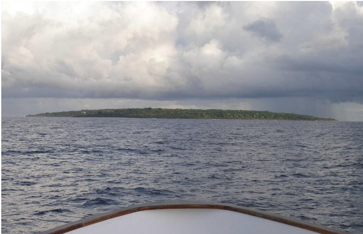
Figure 4. First view of Banaba, from the east, from the Summer Spirit , on the morning of 29 September 2005. The island looks like an upside down canoe or, as Teaiwa (2015) said when seeing her ancestral homeland for the first time on the horizon, “the gentle hump of a turtle floating on the ocean.”