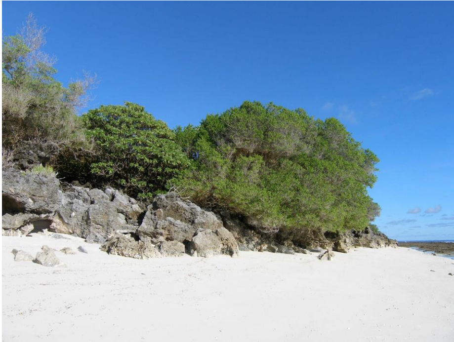
Figure 14. Tournefortia argentea ( te ren ; center) and Pemphis acidula ( Te ngea ) on limestone outcrop (left and right) along the inner beach, north coast of Banaba.