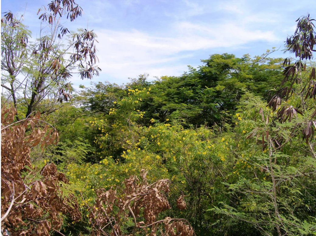
Figure 20. Dominant introduced invasive species Leucaena leucocephala and Tecoma stans (center, with yellow flowers) in secondary vegetation in degraded, mined-out areas, Banaba.