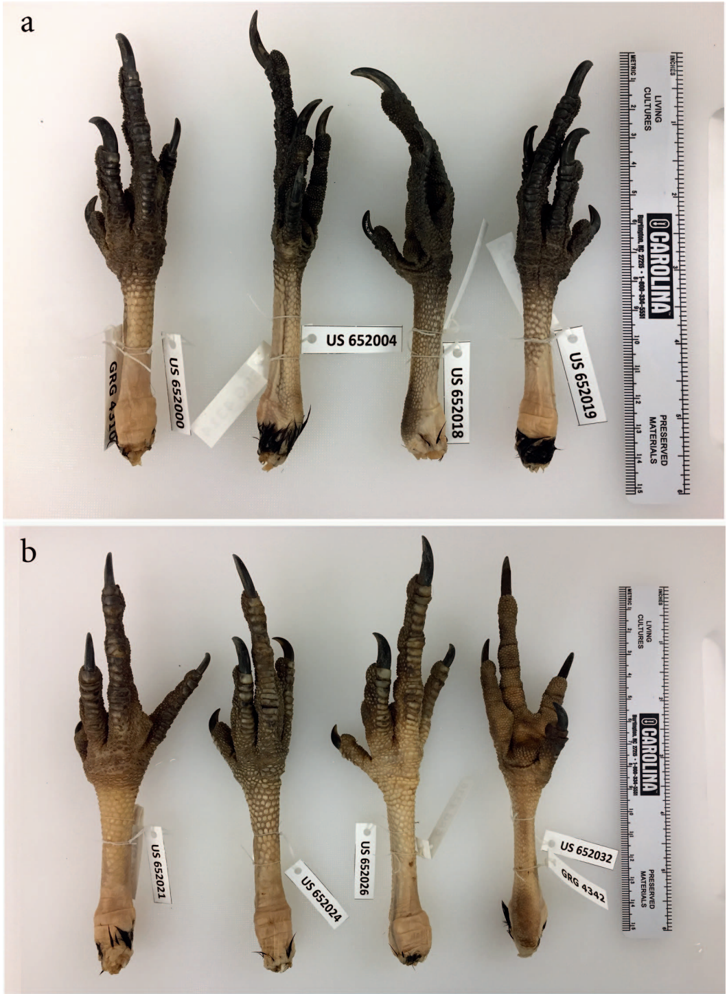
Fig. 4. Tarsi and feet of (a) Cathartes burrovianus urubitinga (left to right; USNM 652000 ♀, 652004 ♂, 652018 ♂, 652019 ♂); and (b) C. melambrotos (left to right, USNM 652021 ♂, 650024 ♀, 652026 ♂, 652032 ♂) after 2.5 years of immersion in 70% ethanol. All specimens are adult except for USNM 652032, which possessed a cloacal bursa (10 × 6 mm).