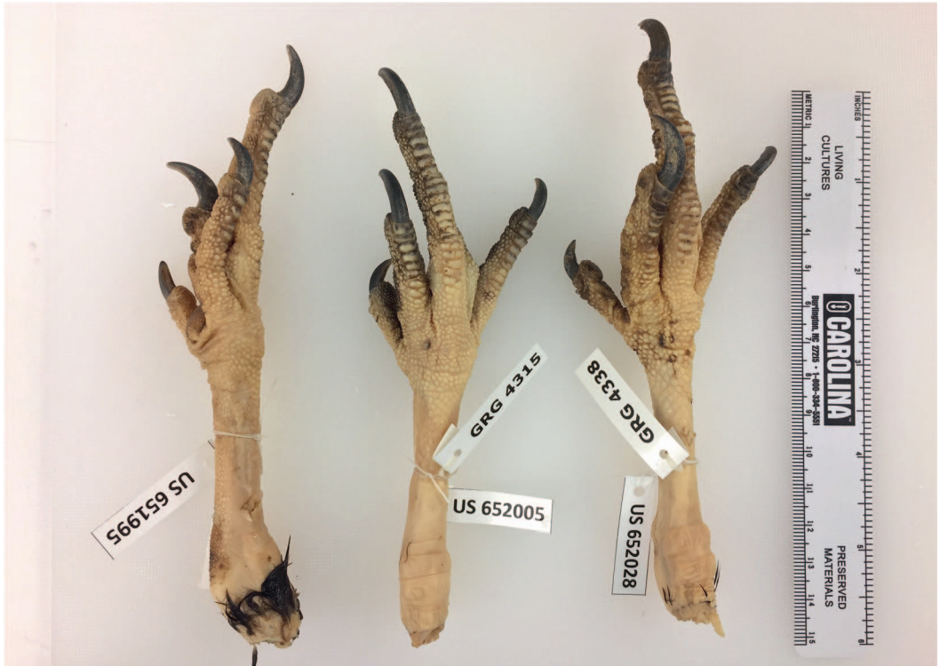
Fig. 2. Tarsi and feet of Cathartes aura ruficollis (left to right; USNM 651095 ♂, 652005 ♂, 652028 ♀), collected in Guyana after 2.5 years of immersion in 70% ethanol.

with chalky urates, except for the rosy-red intertarsal joints. By the time the urates were removed, tarsal color (USNM 652005) had faded to creamy white, faintly tinted with pink (Fig. 1). Rapid fading indicated that the red hue was caused by hemoglobin in subcutaneous capillaries rather than carotenoid pigments. The small reticulate scales on the ventral surface of the tarsus, metatarsal pad (pulvinus metatarsalis), and plantar surfaces of the toes (pulvinus digitalis) were creamy white but obdurately soiled. The scutellate scales on the dorsal side of the distal phalanges were margined with brownish-black. Pigmentation patterns persisted after long-term immersion in ethanol (Fig. 2). Anecdotal observations suggest that the coverage of urates on tarsi and feet may be related to foraging