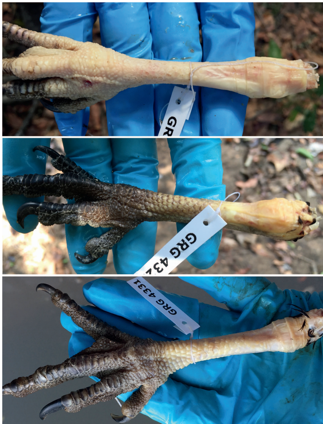
Fig. 1. Washed tarsi and feet of three sympatric species of Cathartes vultures collected in Guyana—(top) C. aura ruficollis ( \delta , USNM 652005); (middle) C. burrovianus urubitinga ( \delta , USNM 652019); (bottom) C. melambrotus ( \delta USNM 652021). Specimens were photographed 45–60 m after death.