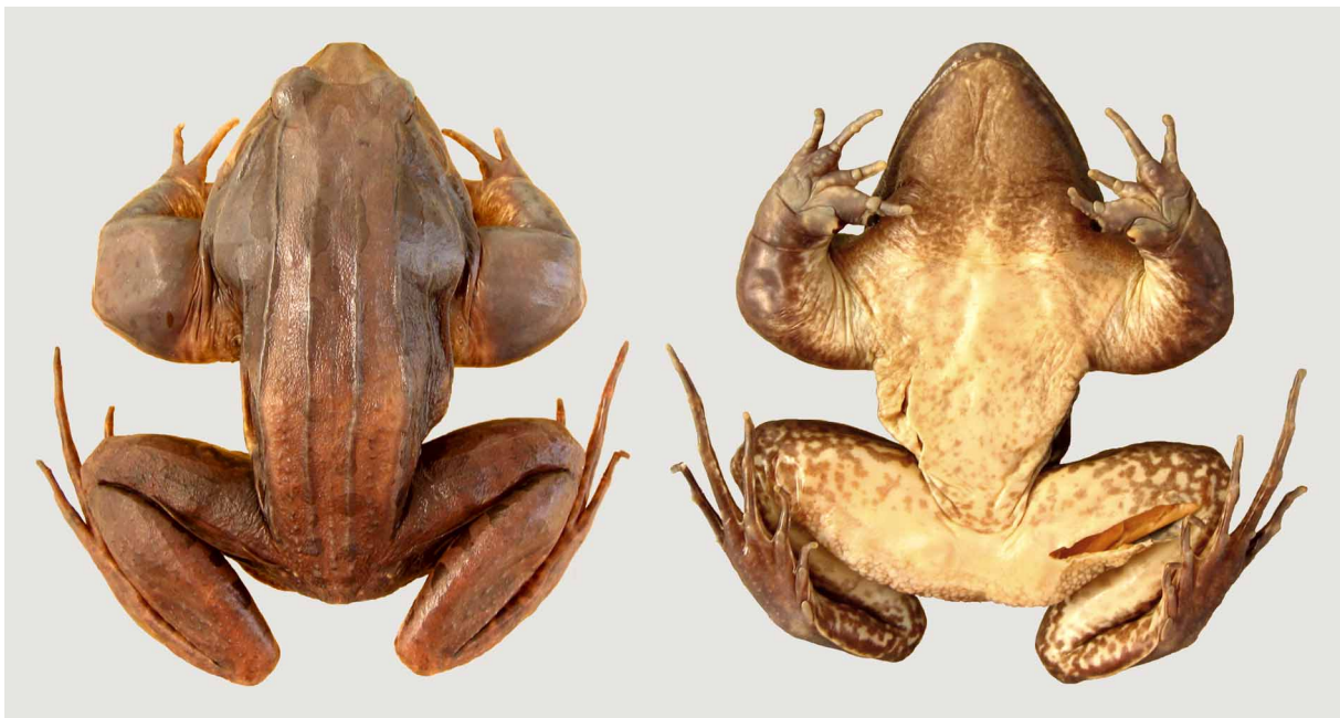
FIGURE 2. Leptodactylus latrans (Steffen, 1815), neotype (MNRJ 30733; 107.0 mm SVL), dorsal and ventral views.

Color: In preservative, general dorsal background color reddish gray; a distinct interocular black spot with two posterior lobes; scattered, rounded black spots on dorsum; a black spot on posterior side of arms; black spots, aligned across the dorsal surfaces of thighs, tibiae, and feet. A black stripe on canthus rostralis, between the nostril and the anterior corner of eye; loreal region uniformly gray, bordered below by small black, approximately triangular spots; border of maxilla gray with light gray spots. Ventral region white with scattered, unshaped small clear gray spots; gular region gray.