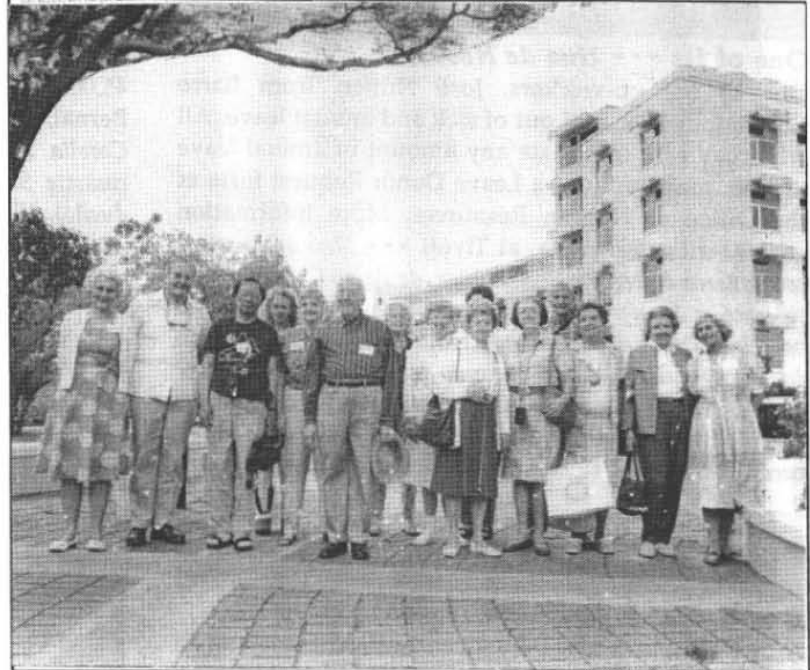
Group from Smithsonian Women's Committee and spouses gathered at the Tupper Center's Corotú Plaza during their recent visit to STRI, Mar 21-26. The group of fifteen met with staff and also visited Barro Colorado Island and Gamboa, the Parque Natural Metropolitano, Naos and Culebra and the San Blas Marine Station ••• Un grupo de el Comité de Mujeres del Smithsonian y algunos de sus esposos se reunieron en la Plaza Corotú del Centro Tupper, durante su reciente visita a STRI, del 21 al 26 de marzo. El grupo de quince se reunieron con el personal, y también visitaron la Isla de Barro Colorado y Gamboa, el Parque Natural Metropolitano, Naos y Culebra, y la Estación Marina de San Blas.