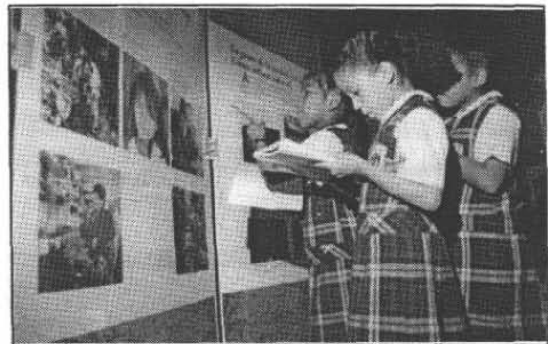
Nuestros Bosques: Nuestra Herencia