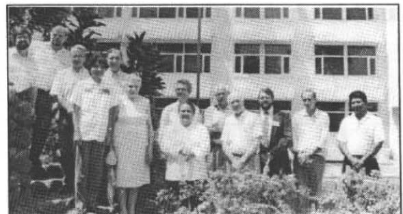
Flora Neotropica Conference