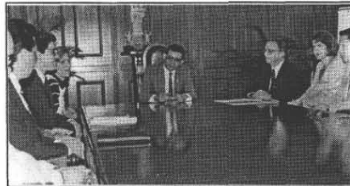
Signing of new agreement with USMA