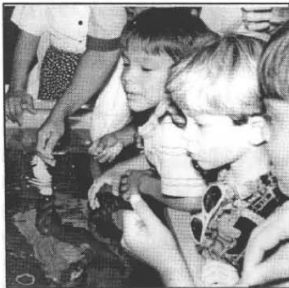
At the Culebra Marine Reserve