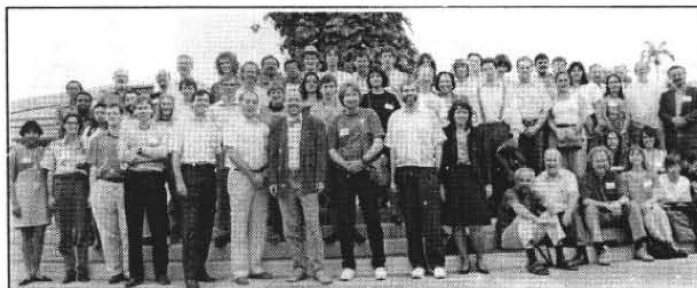
CAM '93 Conference