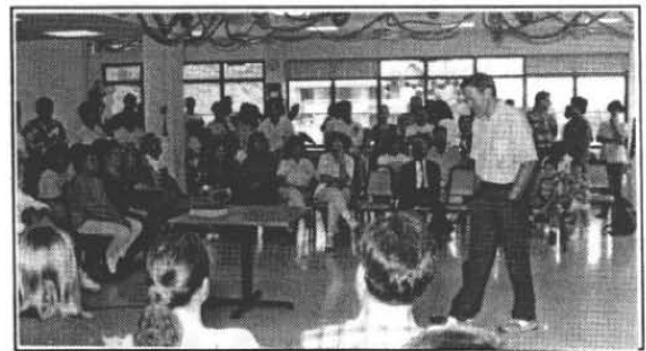
BCI's 70th Anniversary