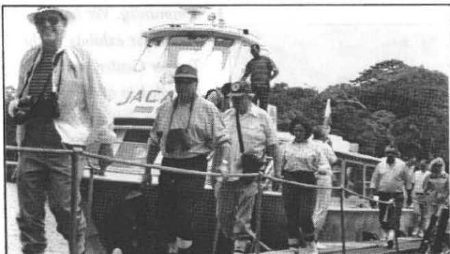
World's Presidents Organization

The work of STRI scientists was highlighted in international scientific journals and newspapers, from Science and Nature to The New York Times and The Economist.