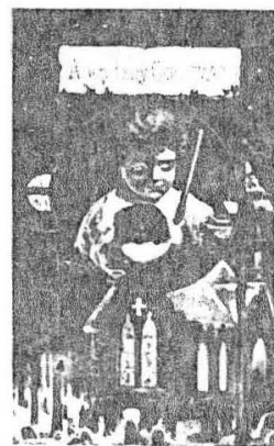
Se reflejan en estas tarjetas del siglo XIX

From the Business Americana Collection, National Museum of History and Technology Smithsonian News Service