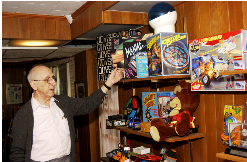
Figure 5. Ralph Baer in his New Hampshire home in 2003, with a display of the many electronic toys and games that he invented.

Baer had registered R. H. Baer Consultants in 1974, with a focus on "inventing, designing and developing electronic toys and games and other novel electronic consumer products." Between 1975 and 1985, he worked closely with Marvin Glass & Associates, an important toy and game developer based in Chicago. As Baer recalled, "Simon, Maniac, Amaze-A-Tron, Computer Perfection and other microprocessor-controlled hand-held games result[ed] from that long and productive relationship." His work as a consultant also included developing talking greeting cards and interactive Christmas lights for Hallmark; talking Golden Books; Tonka Talkin' Tools for Hasbro; interactive electronics for Kenner's Laser Command and MASK action figures; the Smarty Bear Interactive Video System for Galoob (which included an animated plush bear that could talk and interact with paired cartoons played on a VCR), and myriad other electronic toys and games. 19