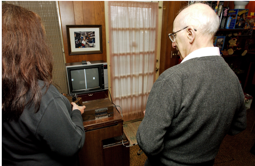
Figure 7. A chuckling Ralph Baer easily wins a game of tennis against the author on the Brown Box.

Although he would continue to invent until his passing in 2014, Baer began to slow down after being diagnosed with chronic lymphocytic leukemia. He had received forty-seven patents in his lifetime of invention. He was awarded the National Medal of Technology in 2004 "for his groundbreaking and pioneering creation, development and commercialization of interactive video games, which spawned related uses, applications, and mega-industries in both the entertainment and education realms." 29 To conclude his unpublished 2002 autobiography, he wrote, "I've had a good run, a great family, a super-supportive better half, great friends, and I was fortunate to have a few more or less notable accomplishments along the way. Not half bad. I'll take it."