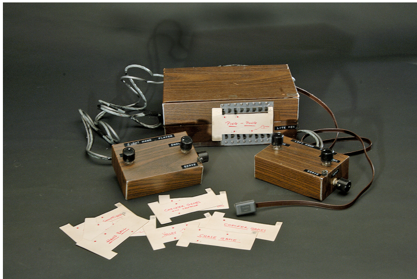
Figure 3. The Brown Box, with two play controllers and cards indicating switch positions for various games.

By 1968 we had finished building our final demonstration game console, the Brown Box. It was switch-programmable and played a large number of sports, maze and quiz-type games as well as a golf game using an actual putter and ball; the latter was mounted at the end of a joystick controller. Hitting the captive ball with the putter, a spot on-screen would move in the direction of the putt and either land on or miss another spot, the "hole." If the putt was sunk, the "ball" disappeared from the screen. In addition, we had several games based on the "gun" so we could shoot at stationary or moving "targets." It worked very well and it was obvious to one and all that playing those games was fun.