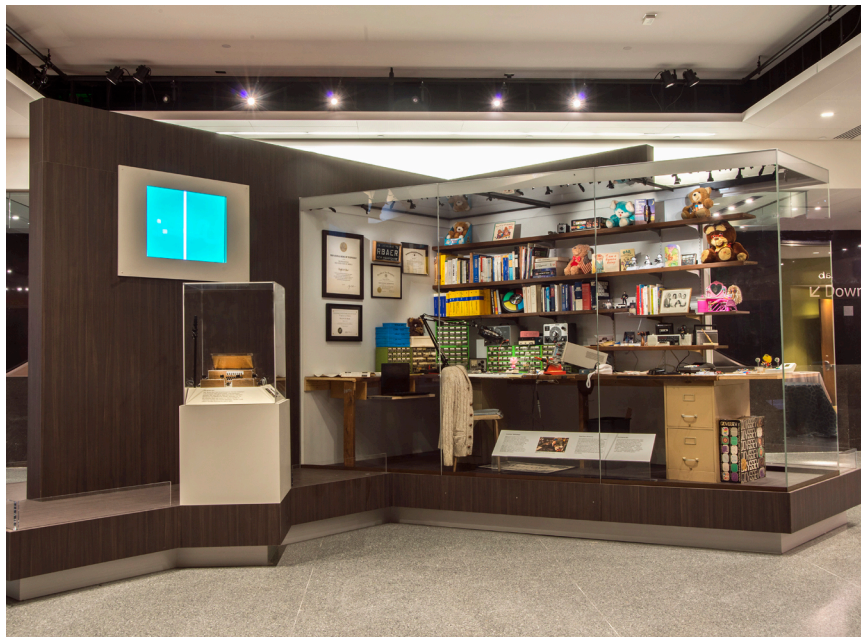
Figure 6. A section of Ralph Baer's home workshop is on display in the Innovation Wing of the Smithsonian National Museum of American History.

Baer's son Mark contacted the Smithsonian about his father's interest in donating his material to the museum, and that initial conversation led to our first visit to Ralph Baer's home in 2003. The rich collection of papers that he deposited are open to researchers in the National Museum of American History Archives Center, and much of the original video game documentation has been digitized and is accessible online. 22 We also collected several of Baer's toys, games, and prototypes, including the Brown Box, and a section of Baer's home workshop. 23 The workshop display is the showpiece of the museum's Innovation Wing.