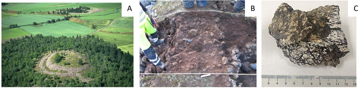
Figure 1. A) An arial view of Broborg. B) Excavation at Broborg, Fall 2017. C) Specimen of vitrified material analyzed in this study.