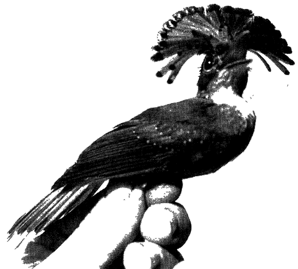
FIG. 3. Male royal flycatcher ( Onychorhynchus coronatus (Müller) 1776) displaying crest. This species is widespread in humid forest of continental Central and South America, but is not known to occur on oceanic or land-bridge islands. Photo by Gary R. Graves, Río Heath, Southeastern Peru, 1977.

Graves & Gotelli (1983) found that species with restricted geographic ranges (total mainland geographic range <100–1°×1° blocks) were significantly under-represented on these islands. However, this pattern cannot account for most of the missing species in Appendix 2; only Atalotriccus pilaris (Cabanis) 1847 (pale-eyed pygmy-tyrant) and Thryothorus rufalbus Lafresnaye 1845 (rufous-and-white wren) have small geographic ranges, and even for these species, the total geographic range is not contained in a small contiguous area (Type II restricted; see Graves & Gotelli, 1983, for definitions of widespread and restricted species). Thus the species in Appendix 2 are missing from