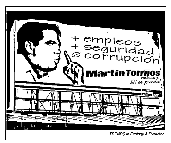
Figure 2. Anti-corruption campaigns are playing a prominent role in the national politics of some developing countries. The sign indicates 'yes' to employment and social security, and 'no' to corruption in Panama.

transitions (particularly those that result in a sudden breakdown of centralized control) could have severe environmental consequences.