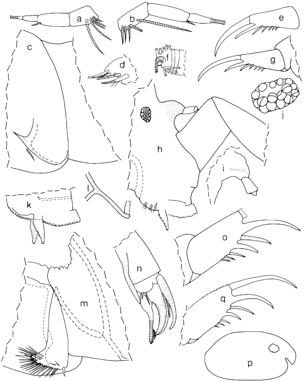
Fig. 1. Sheina orri , male, paratype, BM 1965.11.9.11: a, b, Medial views of endopodites of left and right 2nd antennae. Male, paratype, BM 11965.11.9.7: c, Medial view of coxa of left mandible showing endite; d, Posterior view of 1st exopodial joint of 5th limb; e, Furcal lamella. Male, paratype, USNM 112675: f, Tip of 7th limb; g, Lateral view of left furcal lamella; h, Anterior of body showing lateral eye, medial eye and bellonci organ, upper lip, 1st and 2nd joints of right 1st antenna, and anterior end of esophagus (dashed); i, Medial eye and bellonci organ; j, Right lateral eye; k, Upper lip, anterior towards right; l, Left Y-sclerite, anterior towards left. Female, paratype, BM 1965.11.9.8: m, Medial view of coxa of left mandible showing endite; n, Medial view of tip of left mandible. Female, paratype, USNM 112675: o, Lateral view of right lamella. A-1 instar, paratype, BM 1965.11.9.3: p, Lateral outline of complete specimen showing right lateral eye as seen through shell; q, Right furcal lamella.