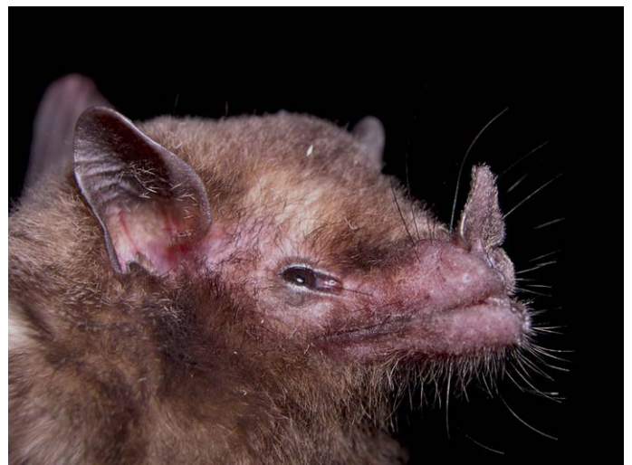
Fig. 1. —An adult Anoura caudifer from Parque Estadual Intervales, São Paulo, Brazil.