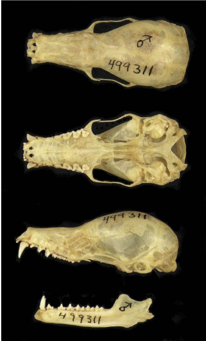
Fig. 2. —Dorsal, ventral, and lateral views of the skull and lateral view of mandible of an adult male Anoura caudifer (USNM [United States National Museum] 49931) from Zaragoza 25 km S, 22 km W, at La Tirana, Colombia.

foot, 9.25, 7.0–12.0 (9.2, 8.0–11.0); length of tail, 4.9, 3.5–7.0 (5.5, 4.0–10.0). Means and ranges (mm) for the same males and females (in parentheses) cited above for length of skull were: 21.8, 20.8–23.8 (21.6, 20.8–22.1).