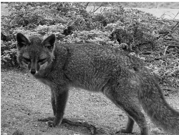
Figure 2. Adult island fox on San Nicolas Island.

Despite research at several Channel Island fossil localities (Lipps, 1964; Orr, 1968; Guthrie, 1993, 1998, 2005; Agenbroad, 1998, 2002b; Thaler, 1998; Agenbroad et al., 2005), foxes are rare or absent in paleontological deposits, with bones known from just four localities. The method of accumulation (carnivore dens, owl roosts, etc.) can influence the types of animals found in a fossil deposit. Guthrie (2005:37–38) suggested that many of the fossil localities he has analyzed may have been deposited by bald eagles ( Haliaeetus leucocephalus ), with at least one historic bald eagle nest known to contain a small number ( n=10 ) of island fox bones (Collins et al., 2005). The few fossil specimens are all morphologically similar to modern island foxes with no documented gray foxes or intermediaries. The “Pleistocene” Santa Rosa fox remains consist of three bones from one individual now known to date to 1480–1280 cal yr BP