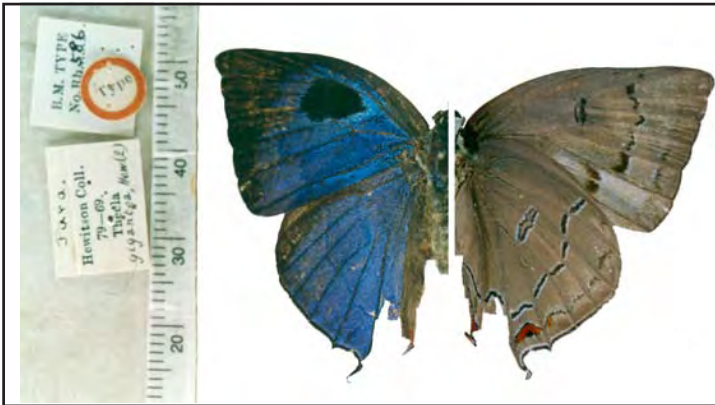
Figure 1. Lectotype male of Megathecla gigantea ; Brazil, Pará (BMNH). Upperside at left, underside at right.