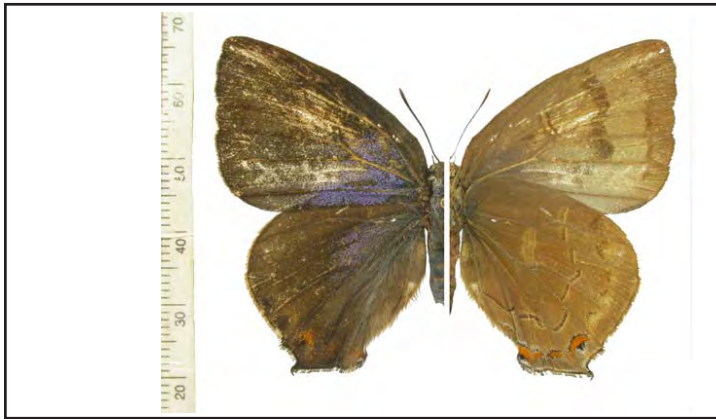
Figure 2. Female of M. gigantea ; Peru, Loreto, Tierra Hermosa, 140 m, 9 Dec 2003, J. J. Ramírez leg. (MUSM). Upperside at left, underside at right.

presumably from another individual. Finally, there is a male in the Oxford University Museum, Cambridge (OXUM) that may have been part of the original type series, but it has no data. D’Abrera (1995) illustrated the Hewitson specimens in the BMNH and incorrectly regarded one of them as the holotype. To fix one of the type series as the unique name-bearer, we designate as lectotype of M. gigantea the male whose underside was illustrated by D’Abrera (Fig. 1). We select this specimen because it possesses an abdomen and because the Bates Collection specimen appears to be a composite.