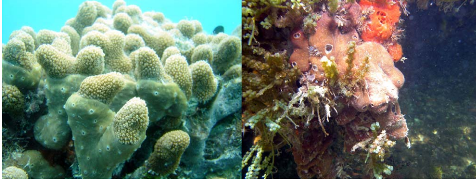
Fig. 1. Chondrilla nucula , reef morphotype on the left and mangrove morphotype on the right.

C. cf. nucula in the Caribbean—from reef to lagoon to mangal—provides an exceptional scenario for the investigation of levels of reproductive isolation between sponge populations from different habitats. It is well known that ecological speciation requires a mechanism of divergent selection to generate reproductive isolation, such as environmental differences, sexual selection, and ecological interactions (Rundle and Nosil, 2005). Environmental differences and disparity of ecological interactions can be demonstrated for mangal and reef habitats, indicating a great potential for ecological speciation between both habitats, especially for sessile species whose habitat choice is irreversible once their larvae have settled and metamorphosed. A possible reduction in gene flow between mangal and reef populations of C. cf. nucula has been detected by sequencing a mitochondrial DNA (mtDNA) fragment of the cytochrome c oxidase subunit I (COI) gene and by comparing both the genetic composition and the morphological divergence between and within the two habitat types from three locations in the Caribbean.