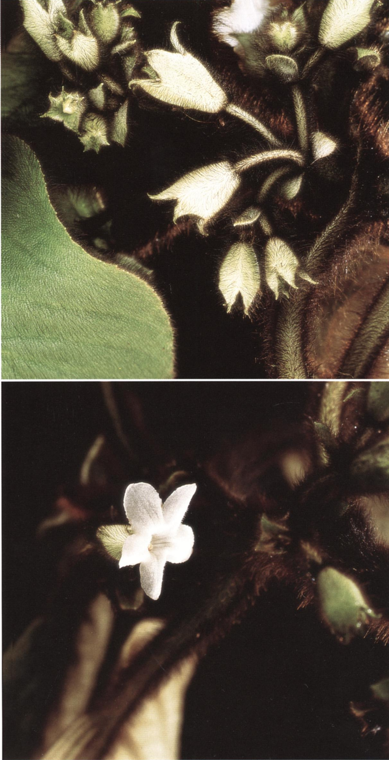
Figure 2. Cyrtandra paliku . —(Left), Corolla. —b. Inflorescence, showing calyx configuration post-anthesis.