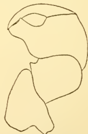
FIG. 59. Tanais stanfordi ; hand of male.

Description of Female. —Head broad at base and attenuated anteriorly, but not produced in a straight process as in the male. The anterior margin has a triangular median point on either side of which the first pair of antennæ are inserted in the depression formed by the median point and the antero-lateral angles. The eyes are situated as in the male. The first pair of antennæ are much shorter than those of the male. The first joint is longest, equal to one-third the length of the head, the two following joints are subequal and