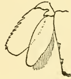
FIG. 4. Dis-cias serrifer , tail fan ( \times 14 ).

Clipperton Island Lagoon, Nov. 23, 1898, one specimen, 27 mm. long, the large pair of chelipeds missing. Very near P. ritteri Holmes, but differs from specimens of that species from Lower California, in being more slender, the rostrum a little more ascending, and slightly arched above the extremity of the eyes, the eyes black in alcohol instead of pale, the sixth abdominal segment a little longer (twice as long as fifth). The first pair of chelipeds and the antennæ correspond to P. ritteri .