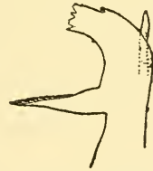
FIG. 1. Discias serrifer , mandible, much enlarged.

Monocarpinea in which the animal is smoothly rounded, not carinated; the rostrum short, depressed; the antennules biflagellate, the outer flagellum with a thickened basal portion; the antennal scale short and broad; the mandible furnished with a molar process and palp; the external maxillipeds provided with an exognath; all the pereiopods with exopods; first pair of pereiopods much larger than the second; both pairs with extremity of merus cup-shaped and articulating at its lower angle only, with the carpus; carpus short; dactylus of first pair circular; pollex slender; fingers of second pair normal; feet of last three pairs diminishing regularly in length, and having dactyli spinulose beneath.