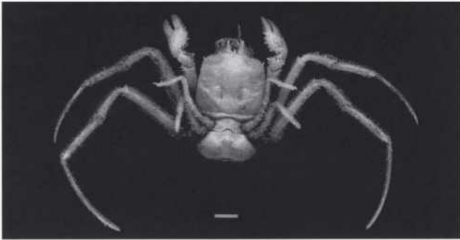
Fig. 1. Cynomoides fitoi , new species, paratype, ♀ ovig 6.1 × 6.2 mm, off Ciénaga Grande de Santa Marta, sta C44, USNM 276179. Scale equals 2 mm.

cal, strongly calcified, fused basally, immovable, and weakly divergent; exceeding distal margin of second antennal segment (in dorsal view); lateral and mesial margins armed with strong spines; dorsal faces with small spines. Corneae lacking.