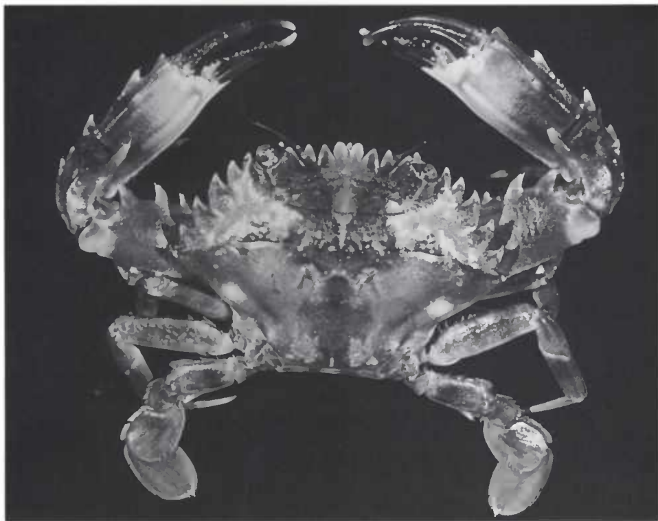
Fig. 2. Charybdis hellerii (Milne Edwards, 1867), male (74 × 49 mm), channel south of Little Jim Island, Ft. Pierce, Florida, USNM 275907.

with 6 sharp, black-tipped teeth (including outer orbital). Frontal region with 6 prominent teeth: 2 inner orbitals plus 4 blunt submedians, latter reaching slightly in advance of orbitals. Chela stout; palm with 5 strong black-tipped spines on dorsal face. Swimming leg with merus and carpus each armed with strong black-tipped spine on posterior margin distally; propodus with row of spines on posterior margin. Sixth abdominal segment of male about as broad as long, posterodistal margins rounded; telson bluntly triangular, basal width less than distal width of sixth abdominal segment. Male first gonopods, when viewed in situ, reaching approximately to suture between fifth and sixth thoracic somite, diverging in distal third; each with row of about 25 slender spines on lateral margin distally (spines diminishing in length distally).