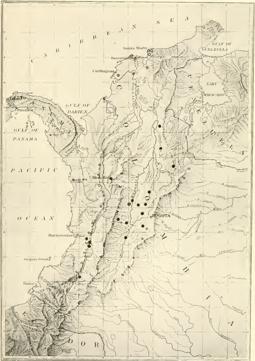
DISTRIBUTION OF EUPSYCHORTYX IN COLOMBIA

● E. leucopogon leucotis , ⊙ E. l. decoratus , ○ E. l. littoralis .