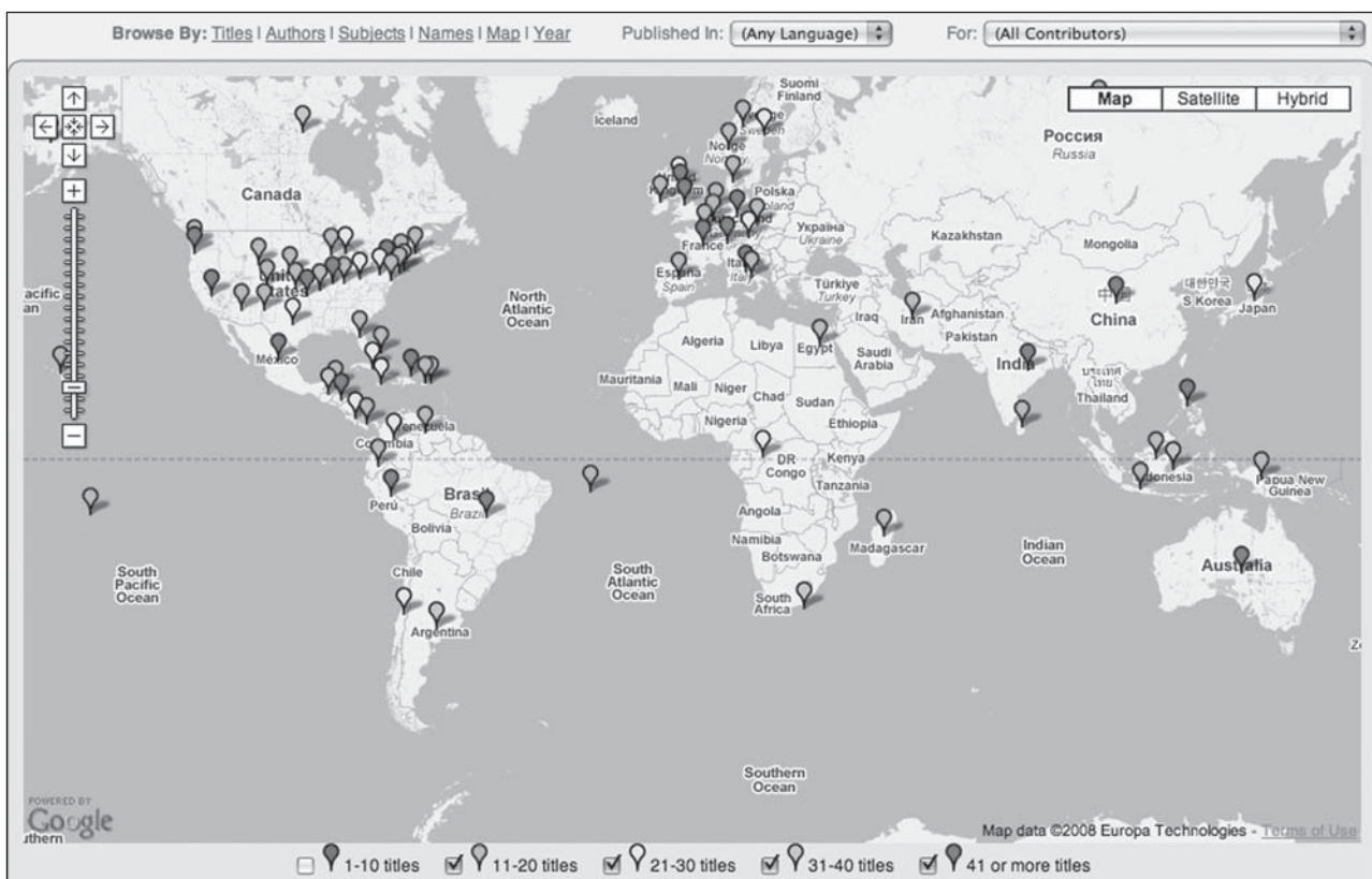
Figure 3. The Library of Congress Subject Headings of the volumes in the BHL are geocoded and then mapped using the Google Maps API.

In general, the BHL project attempts to keep copyright infringement risk low by tackling the public domain literature first, seeking permissions for digitization, negotiating alternative agreements and moving on when none of these tactics applies. BHL has an opt-in copyright model. The BHL Program Director has opened negotiations with a variety of publishers from small, learned societies to large commercial organizations. As of December 2008, the BHL has obtained permissions to digitize 47 titles from museum and small society publishers. The BHL will digitize the entire run of the publications to the most recent issues, as per the negotiated permissions, and mount them on the BHL portal at no cost to the societies.