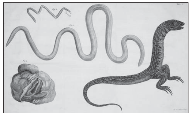
Figure 5. A sample fold-out from Klein, Jacob Theodor. 1755. Tentamen herpetologiae . Leidae & Gottingae : Apud Eliam Luzac, Jun. The original foldout was 10" by 15".

As of December 2008, there were more than 10.3 million pages, contained in nearly 8,760 titles (more than 25,000 volumes) accessible through the BHL portal. The project has demonstrated that: the concept of mass scanning of general collections is possible; there are high levels of OCR accuracy in late 19th and 20th century printing. The taxonomic intelligence (species name finding) across millions of pages against nearly 11 million names in Name Bank is highly effective. Administratively separate and geographically disparate institutions can collaborate on a complex, multi-level project and achieve concrete results in a specific knowledge domain.