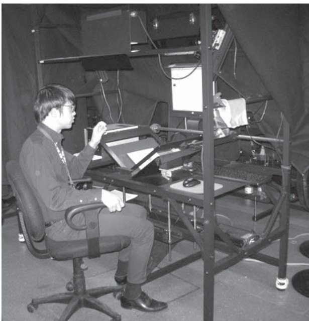
Figure 4. One of the Internet Archive scanning stations at the Boston Public Library.

Many of the early publications have fold-outs or are larger than average size. Initially, the Internet Archive had strict limits on size and did not scan books with fold-outs. Other issues that cause