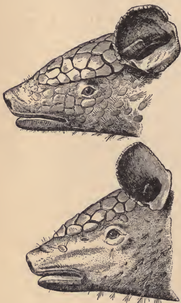
FIG. 1.—Head from side: upper figure, Tatoua (Tatoua) hispida ; lower figure, T. (Ziphila) centralis (type). \frac{2}{8} nat. size.

1869. Dasyopus gymnurus Frantzius, Wiegmann's Archiv für Naturgeschichte, XXXV, Bd. I, p. 309 (not Dasyopus gymnurus Illiger, 1815).