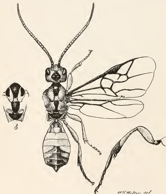
FIG. 1.— Proteropoides hertzogi Viereck.

Type— Proteropoides hertzogi , new species.