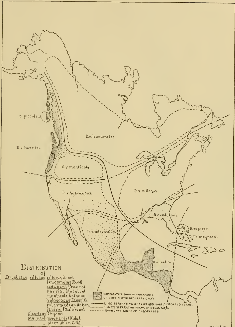
DISTRIBUTION OF Dryobates villosus AND SUBSPECIES.