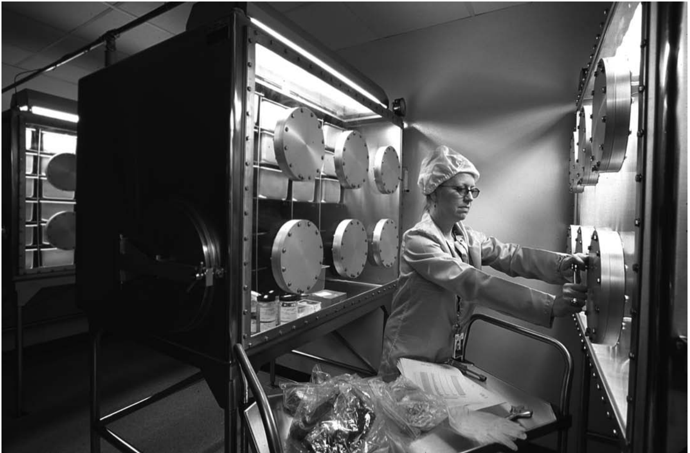
FIGURE 4. Meteorite storage laboratories at the Smithsonian Museum Support Center in Suitland, Maryland, modeled on the facility used for lunar rocks at NASA's Johnson Space Center. The water- and oxygen-free nitrogen gas in the cabinets keeps meteorites from oxidizing and free from contamination by environmental pollutants such as organic compounds, heavy metals, and salts, which could reduce the scientific value of the specimens.

connected by a corridor of offices and laboratories. Shortly after this facility opened, planning began for building what became essentially a duplicate of the dry nitrogen storage facility for Antarctic meteorites at Johnson Space Center in Houston, and the new museum storage facility opened in the fall of 1986. The first significant transfer (126 specimens) of Antarctic meteorites to the Smithsonian occurred in 1987. Regular annual transfers from Johnson Space Center to the museum began in 1992, and the flow of meteorites increased tremendously in 1998. At that point, the Meteorite Processing Laboratory at Johnson Space Center was essentially full, and the subsequent influx of newly recovered meteorites necessitated the transfer of large numbers of specimens to the SI. By the end of 2004, more than 11,300 individual specimens had been transferred to the museum. When coupled with the chips and thin sections used for the