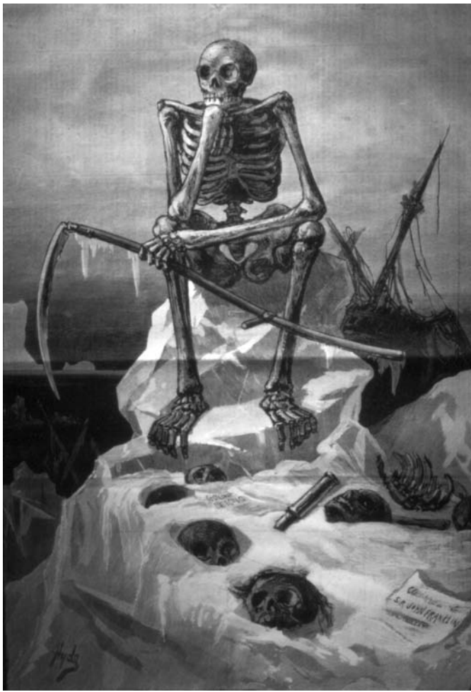
FIGURE 1. The terrible tragedy surrounding the loss of life during the U.S. North Polar Expedition (1879–1881) following on the debacle of the British Northwest Passage Expedition under Sir John Franklin (1845–1848) had soured public opinion in the United States on the benefits of polar exploration and transformed perceptions of the Arctic as a deadly and foreboding landscape. Editorial cartoon, Frank Leslie's Illustrated Newspaper , 20 May 1882, William Dall papers, RU7073, SI Archives.

and foreboding visions of the ubiquitous and relentless ice of the post-Franklin era (Figure 1), to the modern era with its coffee-table books of stunning photography of polar bears and vast unpopulated expanses (Loomis, 1977; 1986; Grant, 1998). But the Arctic is also a homeland, and has been for thousands of years. Arctic inhabitants have evolved a remarkable and practical adaptation to the climatic and ecological extremes of the northern polar world. Indigenous knowledge—based on observation and inference and passed from generation to generation—forms an astute and perhaps surprisingly complex interpretation of