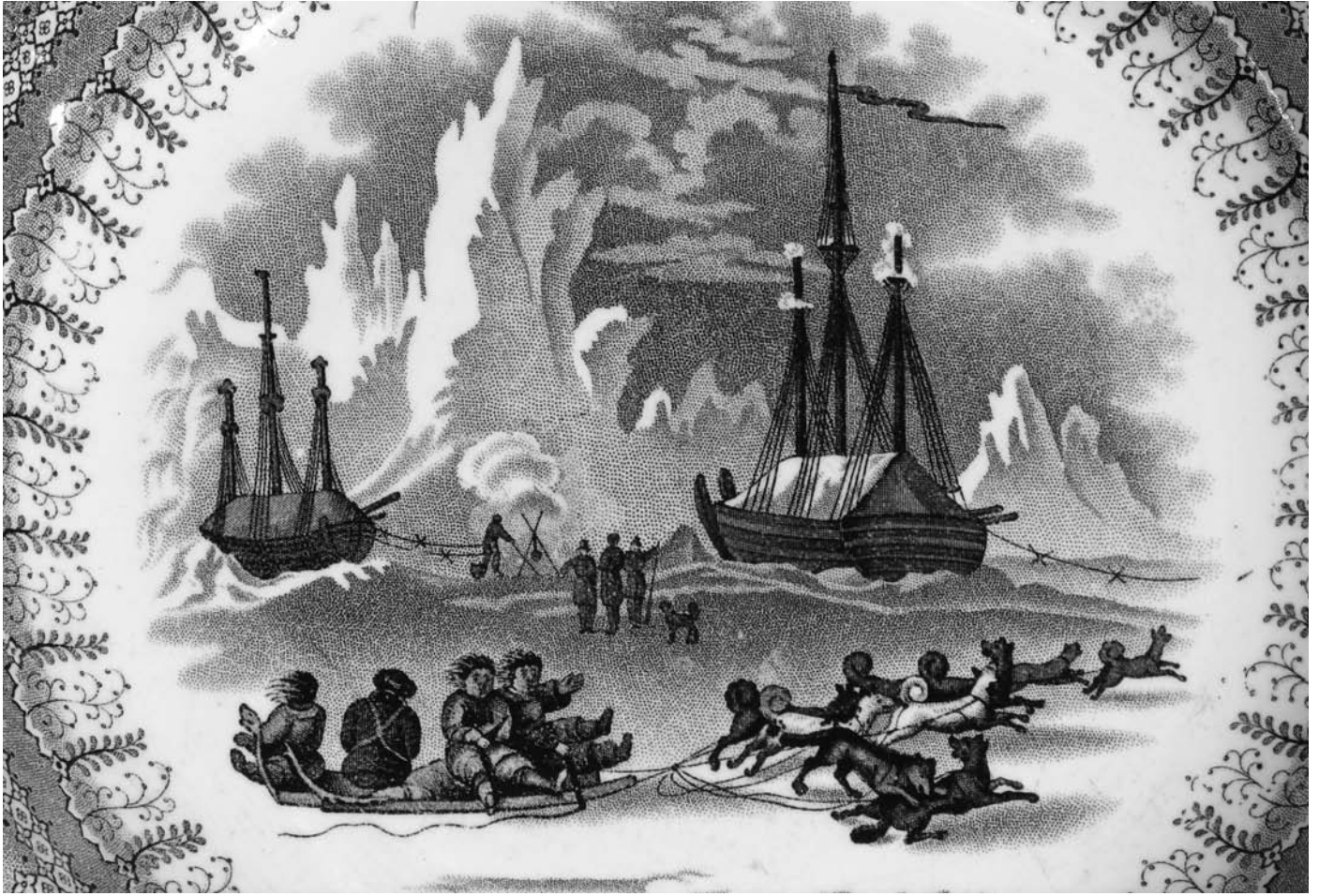
FIGURE 2. Illustrations accompanying William Edward Parry's popular accounts of his search for the Northwest Passage (1819–1834) depict the central Canadian Arctic Inuit as whimsical and childlike catered to a European perception of the polar region as a fantastic otherworldly place (Parry 1821, 1824). Detail from a Staffordshire ceramic plate, "Arctic Scenery" ca. 1835.