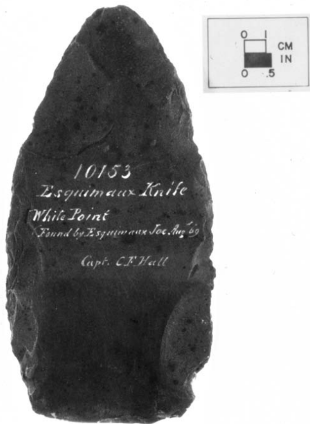
FIGURE 3. Thule ground-slate whaling harpoon endblade found by Charles Francis Hall's Inuit companion Eberbing, also known as "Esquimaux Joe." Historically, the role of Inuit guides and companions in the production of Arctic science was rarely acknowledged. SI-10153, Charles Francis Hall collection, NMNH. (S. Loring photograph)

works remain as some of the lasting triumphs of the first IPY accomplishments.