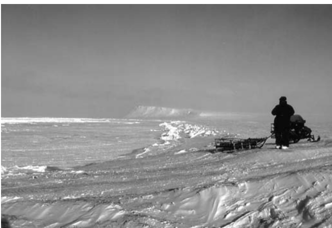
FIGURE 6. “Winter that is locally formed.” Thin young ice solidifies along the shores of St. Lawrence Island, February 2008. Leonard Apangalook stands to the right, next to his sled.

absence of solid pack ice, people have to adapt to a far less stable local new ice that can be easily broken by heavy winds, storms, and even strong currents (Figure 6). According to the elders, this ice is “no good,” as it is very dangerous for walking and winter hunting on foot or with skin boats being dragged over it, as used to be a common practice in the “old days” (Oozeva et al., 2004:137–138, 142–143, 163–166). As a result, few hunters dare to go hunting on ice in front of the village in wintertime (Figure 7). Instead,