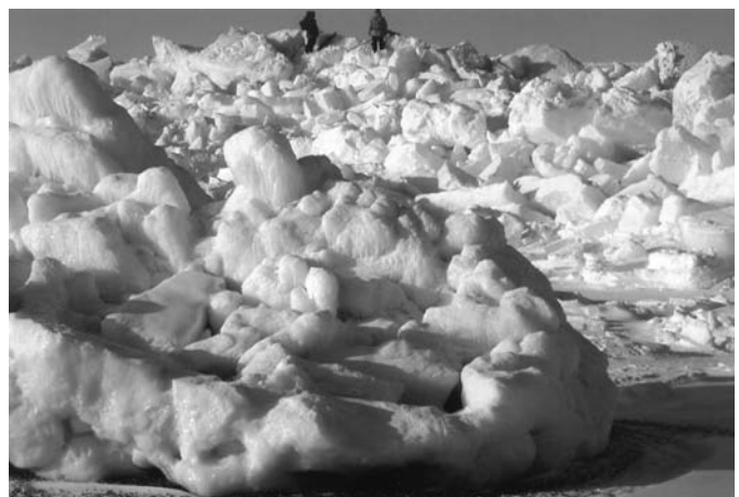
FIGURE 8. Two Gambell hunters are looking for seals from ice pressure ridges. The ridges look high and solid, but they can be quickly destroyed under the impact of strong wind or storms. (Photo, Igor Krupnik, February 2008)

Winter conditions in Gambell, with the prevailing northerly winds, are often interrupted by a few days of vi-