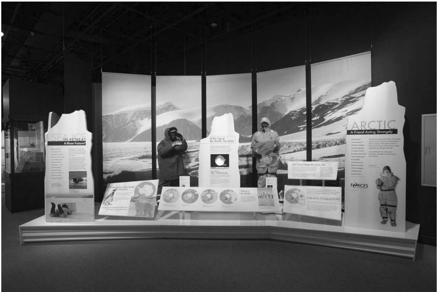
FIGURE 1. New public face of polar science, the exhibit Arctic: A Friend Acting Strangely at the National Museum of Natural History, 2006.

The new IPY includes scores of science projects focused on the documentation of indigenous environmental knowledge and observations of climate change (Hovelsrud and Krupnik, 2006:344–345; Krupnik, 2007); it serves as an important driver to the growing partnership between Arctic residents and polar researchers. Many Arctic people also see IPY 2007–2008 as the first international science venture to which they have been invited and one in which