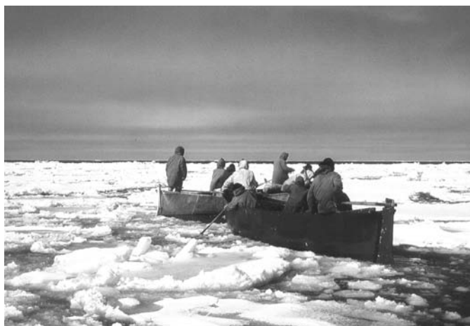
FIGURE 9. Hunting in boats in dense floating ice is now a common practice in Gambell during the wintertime.

olent storms and warm spells brought by southerly winds. This happened twice in the winters of 1899–1900 and 1900–1901, and three times in the winter of 1898–1899 (Oozeva et al., 2004:185). According to Conrad Oozeva, an elderly hunter from Gambell, the warm spells have been also typical in his early days: