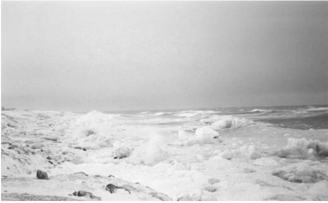
FIGURE 5. The new ice is being formed from the pieces of floating icebergs and newly formed young ice. There are terms for every single piece of ice in this picture and many more in the local language (“Watching Ice and Weather Our Way,” 2004, p. 114).

absence of solid pack ice, people have to adapt to a far less stable local new ice that can be easily broken by heavy winds, storms, and even strong currents (Figure 6). According to the elders, this ice is “no good,” as it is very dangerous for walking and winter hunting on foot or with skin boats being dragged over it, as used to be a common practice in the “old days” (Oozeva et al., 2004:137–138, 142–143, 163–166). As a result, few hunters dare to go hunting on ice in front of the village in wintertime (Figure 7). Instead,