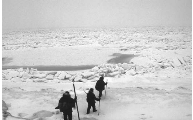
FIGURE 7. Hunters rarely venture onto young unstable ice and they usually prefer to be accompanied by an experienced senior person.

they have to rely upon shooting the animals from the shore or from ice pressure ridges (Figure 8) or upon hunting in boats in the dense floating ice, a technique that is now the norm in Gambell during winter months (Figure 9). In the early teachers’ era of 100 years ago, boat hunting for walrus did not start in Gambell until early or even late March (Oozeva et al., 2004:187–188).