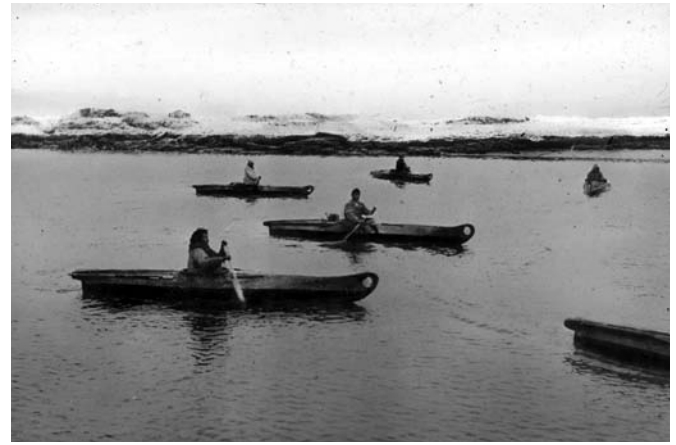
FIGURE 2. An uncatalogued hand-tinted lantern slide: “Men hunting in kayaks, probably near Kwigillingok,” in 1935/1936, Alaska, by Leuman M. Waugh, DDS, based on comments from Frank Andrew, 2002.

Then during [the following] spring they began to go down to the ocean. I stopped sleeping, wondering when he would let me go. They eventually began to catch sea mammals. After that, my late older sister told me that they were going to take me. I was so ecstatic because I loved to be by the ocean when I went to fetch their catches. And we would be reluctant to go back up to land sometimes. It was always calm.