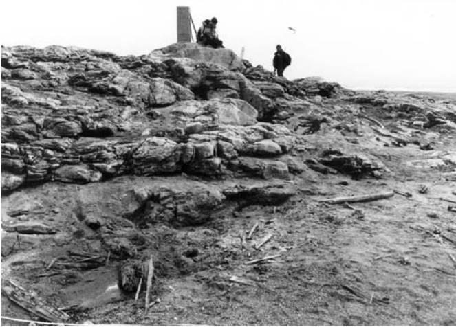
FIGURE 2. The Andrée campsite in 1998 was completely exposed. Fragments of the balloon, clothing, and other items were visible.

the perspective of soil chemistry, the site is analogous to the environment of Late Post Glacial hunters living near the ice margins of Scandinavia 9,000 years ago. In an environment like this, almost all organic and phosphate-containing materials were brought to the site by man or beast. Indications of burning were certainly an indication of human presence. Small groups of hunters slaughtering and subsisting on animals left relatively high phosphate deposits in the same types of soils. These inorganic phosphates bind with the soil and remain for thousands of years. Citric acids releases the phosphate and this can be measured using colorimetric (phosphorous-molybdate)-based methods. Johan Olofsson provided the expertise for soil sampling and analysis (Broadbent and Olofsson, 2001).