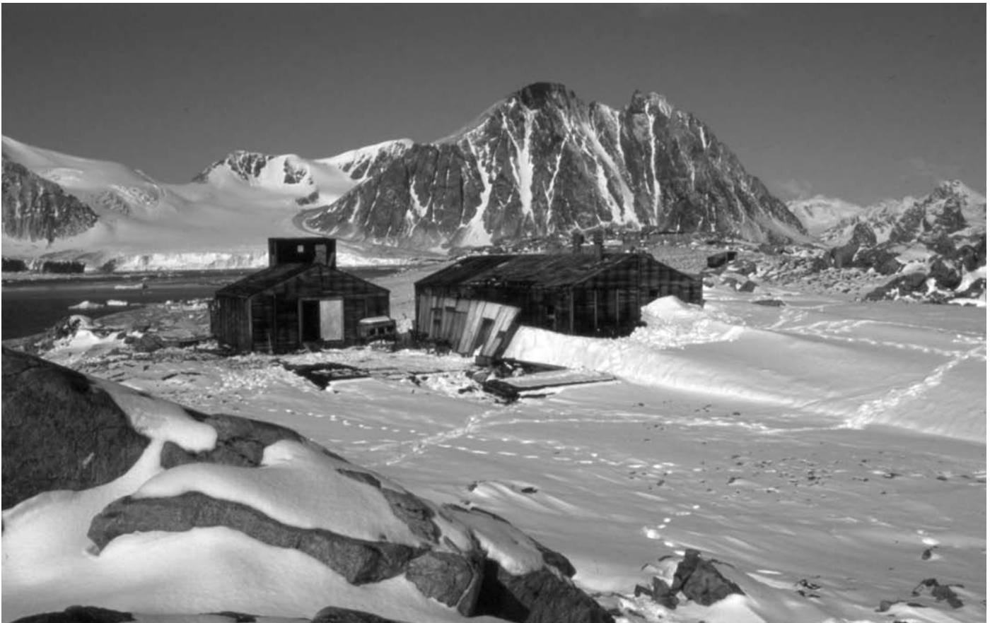
FIGURE 3. The abandoned East Base on Stonington Island, Antarctica. The Science Building with its weather tower and the Bunkhouse building were intact. The crate containing a spare engine for the Curtis Wright Condor biplane can be seen in front of the Science Building.

East Base was hastily abandoned on 22 March 1941 under the looming threat of war. The 26 men, with a smuggled puppy and a pet bird—Giant Petrel, later donated the