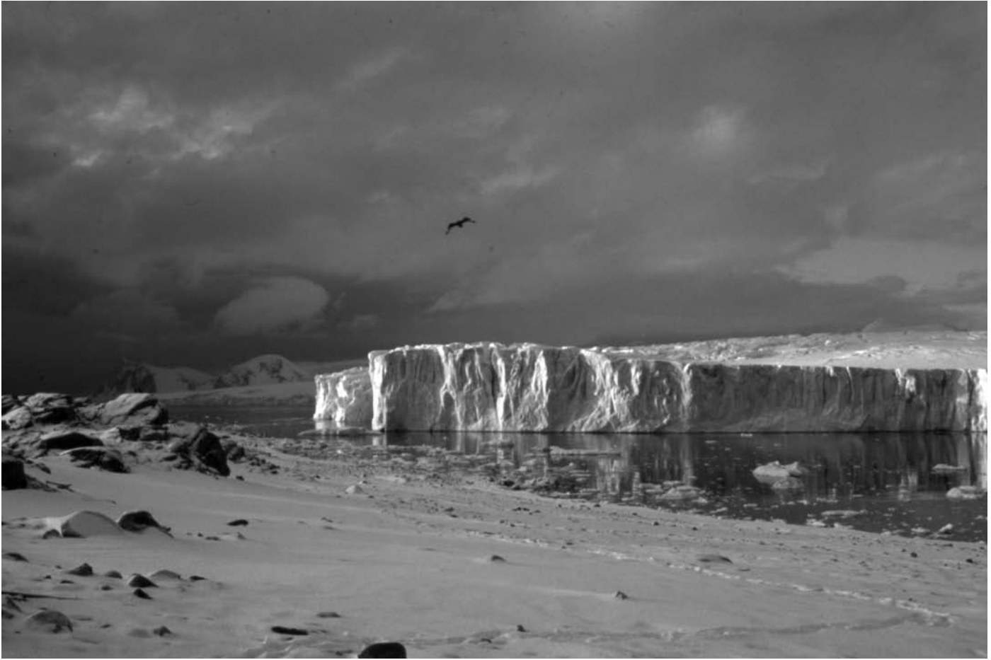
FIGURE 5. The gap between Stonington Island and the Northeast glacier, 1992. As late as in the 1970s, an ice bridge connected the island to the Antarctic Peninsula; it had been the major reason for choosing the island as a base in 1940. The changes reflect rapid warming in the region.