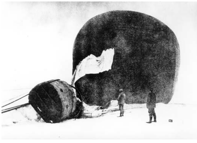
FIGURE 1. The Eagle shortly after landing on the sea ice at 82° 56' N on 14 July 1897. Andrée and Fraenkel are looking at the balloon. The image was developed from a roll of Kodak film recovered from White Island in 1930.

The balloon had gone down on the sea ice on 14 July 1897. Because of icing the balloon could simply not stay aloft and after 33 hours of misery the decision was made to land. They had reached 82° 56' north latitude (Figure 1). They were well equipped with sleds and a boat and from 14 July until 5 October they trekked on the sea ice, first east-