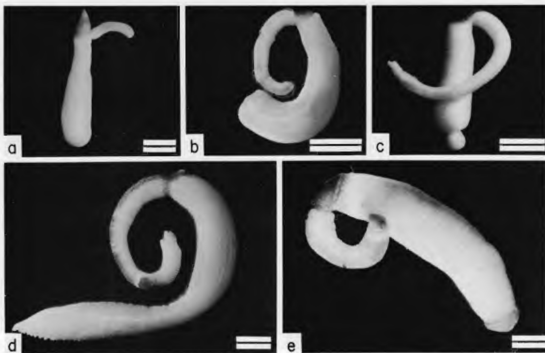
FIGURE 139.—Common sipunculans from Carrie Bow Clay: a, Lithacrosiphon alticonus ; b, c, Aspidosiphon brocki (specimen in c undergoing asexual reproduction, division will occur at the point of the constriction, the posterior portion forming a juvenile individual); d, Phascolosoma perlucens ; e, Paraspidosiphon steenstrupi . (Scale = 2 mm.)

The greatest concentration of sipunculans was found on the reef crest (station 2). The substratum of this zone, partially exposed at low tide and subject to strong wave action, consists of in-place scattered live coral heads on a coral rock pavement, coral boulders, and coral rubble. The coral rock, predominantly Porites astreoides Lamarck and Acropora palmata (Lamarck), contains traces of sub-microcrystalline magnesium calcite (Macintyre, 1977) and consists of a relatively unaltered aragonite coral skeleton. All four rocks (totaling 4 kg) from this station consisted of dead Porites astreoides . Growths of coralline and filamentous