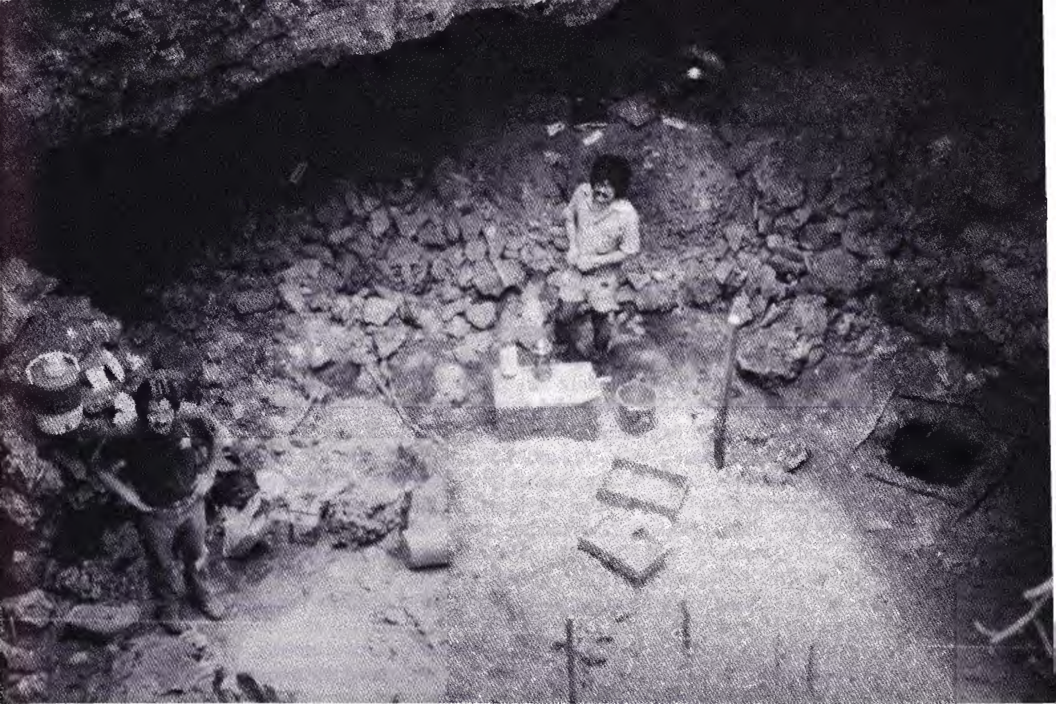
Figure 35.2. The largest of the fossiliferous sinkholes in the raised limestone reef at Barber's Point, Oahu. The large stone cairn at the left and the rock wall extending from it are prehistoric Polynesian modifications of the site. Bones of extinct birds were recovered in association with Polynesian-introduced marker taxa in the fine dusts beneath the overhang at the top of the picture. Additional bones of extinct birds, cultural remains, a radiocarbon-dated hearth, and evidence of agricultural use of the sinkhole were uncovered in the unsheltered sediments. A test pit, later greatly expanded, may be seen in these sediments at the right of the picture.

In another of the larger soil-filled sinks excavated at Barber's Point, bones of extinct birds were found in the upper 5 cm of sediment and to depths of nearly 40 cm. Disassociated bones of Rattus exulans occurred throughout the deposit, although they were more abundant in the upper portions. In cores taken from this site, shells of Lamellaxis were distributed throughout the column. In another sinkhole with deeper sediments, Lamellaxis was found two-thirds of the way down into the layer that produced the most bones of extinct birds. It is evident that much of the deposition of bones of extinct birds at Barber's Point took place during the prehistoric Polynesian period. Kirch and Christensen (1981) also document the decrease in abundance and eventual extinction of a number of species of endemic land snails up through the stratigraphic column.