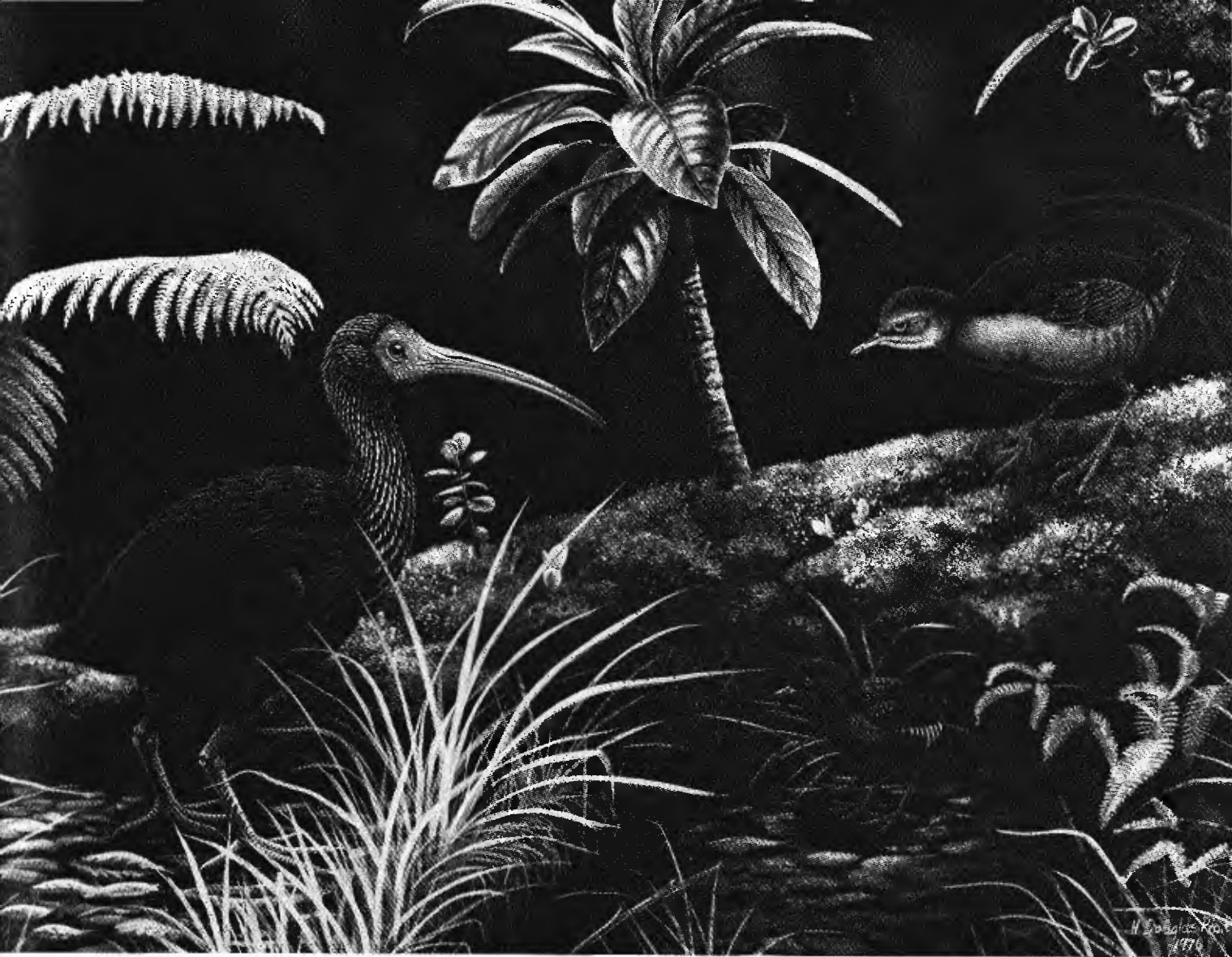
Figure 35.3. Extinct flightless ibis (left) and flightless rail from the Hawaiian Islands. (Courtesy of B. P. Bishop Museum, Honolulu. Painting by H. Douglass Pratt)