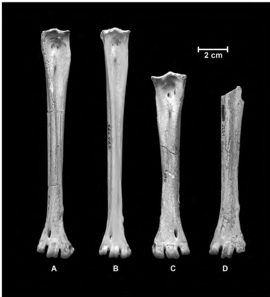
Figure 1. Tarsometatarsi in anterior view of large fossil West Indian Accipitridae compared with that (B) of the Great Black-Hawk Buteogallus urubitinga (USNM 345775). A, Buteogallus borraisi (CZACC 400-659); C, Amplibuteo woodwardi (WS 365); D, Titanohierax gloveralleni , holotype (MCZ 2257). The bone of B. urubitinga has been photographically enlarged to the same size as that of B. borraisi and the scale bar does not apply to image B.

Status and distribution. Extinct species, known only from Cuba.