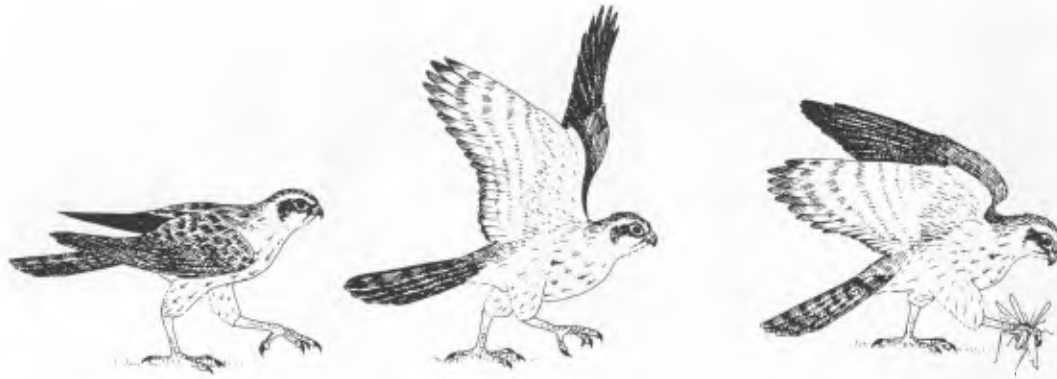
Fig. 3. Stances of the Australian Brown Falcon Falco berigora when feeding on the ground. It is hypothesized that perhaps the adaptations of the extinct Cuban fossil Falco kurochkini new species, may have been for a more terrestrial existence than in other species of the genus. (Figure from Marchant & Higgins, 1993, p. 240).

prey such as insects and lizards on the ground. It could then be viewed as occupying the niche of a diminutive caracara (e.g., Caracara, Milvago ), the caracaras being more terrestrially adapted members of the Falconidae.