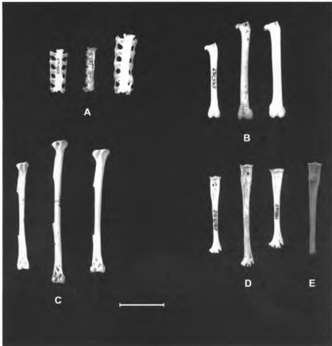
Fig. 2. Notarium and hindlimb elements of Falco kurochkini , new species (middle bone in each group), compared with F. sparverius sparverioides USNM 555167 (left in each group) and F. columbarius USNM 291880 (right in each group): A, notaria in ventral view (paratype MNHNCu P3221); B, left femora in anterior view (paratype MNHNCu P3222); C, right tibiotarsi in anterior view (paratype MNHNCu 3227); D, tarsometatarsi in external view (holotype MNHNCu P3229); E, left tarsometatarsus lacking distal end from Camagüey (paratype Instituto de Gcología y Paleontología 406-3). Scale = 2 cm.

The habits of the long-legged Australian Falco berigora may provide a clue to the adaptations of F. kurochkini . The former is an opportunistic carnivore and scavenger that may feed upon prey from the size of rabbits to insects (Marchant & Higgins 1993). It uses various methods of hunting