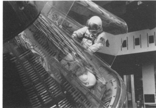
Fig. 3. Gemini IV, after conservation. First extravehicular activity by astronauts Ed White and James McDivitt, June 1965.