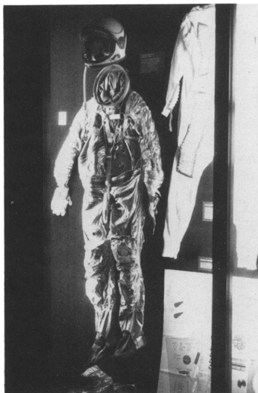
Fig. 2. A project Mercury spacesuit that has been on exhibit since 1976. The exhibit techniques that are contributing to the spacesuit's deterioration include improper support, internal fluorescent lights at close proximity to the suit and uneven lighting.

Moreover, spacesuits, while important, were a minor element in a very large undertaking. There was great pressure to open NASM ahead of schedule. The museum staff was small, espe-