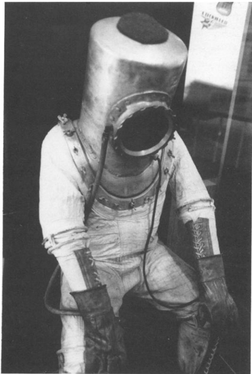
Fig. 1. Wiley Post's pressure suit, ca. 1934. As the world's first practical pressure suit, this was an important step on the road to space. Post wore this suit while setting a high-altitude, high-speed record in his plane, the Winnie Mae (March 1935).

ces in spacesuit design resulted from materials research and development as well as from experience gained from previous suit design. Despite significant advances in materials engineering and processing since the dawn of the space age, there is much yet to be learned, especially with regard to how such materials will age.