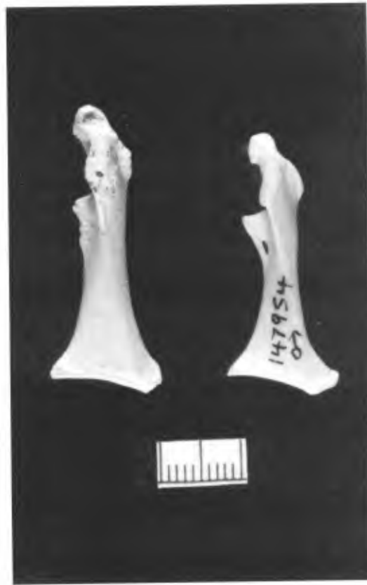
Fig. 1. Left coracoids of Hawaiian Hawk ( Buteo solitarius ) in ventral view. The larger specimen on the left (USNM 490733) is a fossil from the Makawehi dunes on Kauai, presumably from a female, contrasted with that from a modern skeleton of a male, which is the smaller sex (BPBM 147954). The scale is in mm.