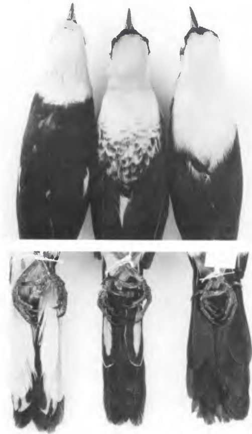
Fig. 1. (Top) Dorsal view of adult males of Icterus mesomelas (left), I. chrysater (right), and a hybrid between these two species (middle, USNM 403540). (Bottom) Ventral view of the tails of the same specimens.

yellow in the outer rectrix in a manner somewhat similar to that in the hybrid. All of these were clearly subadult birds, however, and the edges of the yellow pattern were more diffuse, sometimes much more so.