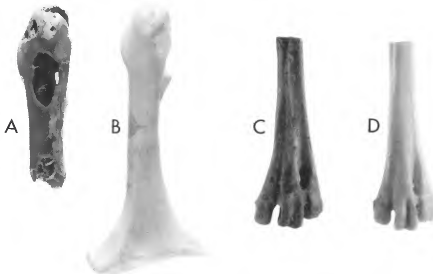
Fig. 2. Fossil and recent species of Scopus : right coracoid, ventral aspect (A, B); distal end of left tarsometatarsus, cranial aspect (C, D). A, Scopus xenopus new species, paratype SAM-PQ-L28440S; B, Scopus umbretta , TM 42863; C, Scopus xenopus , new species, holotype SAM-PQ-L43396; D, Scopus umbretta , USNM 18898. Figures are 2 \times .

striking similarities between the Shoebill ( Balaeniceps rex ) and the Pelecaniformes; a number of these same characters are also present in Scopus . The highly derived order Pelecaniformes must have had its origins in some less specialized group. Such a group may have included the ancestors of Scopus and Balaeniceps , a possibility that merits detailed investigation.