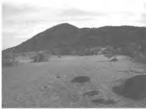
FIG. 2. Red Siskin habitat in the Rupununi, Guyana. Photograph taken from top of granite dome (in foreground). The savanna has been subjected to repeated burning and, as a result, woody vegetation had been reduced and the savanna and deciduous woodland interface was abrupt. Photographed October 2000 by M. Robbins.

habitat—the savanna and semihumid woodland interface—in the Rupununi of Guyana. Because of the area's inaccessibility and rough terrain, surveys were made on foot.