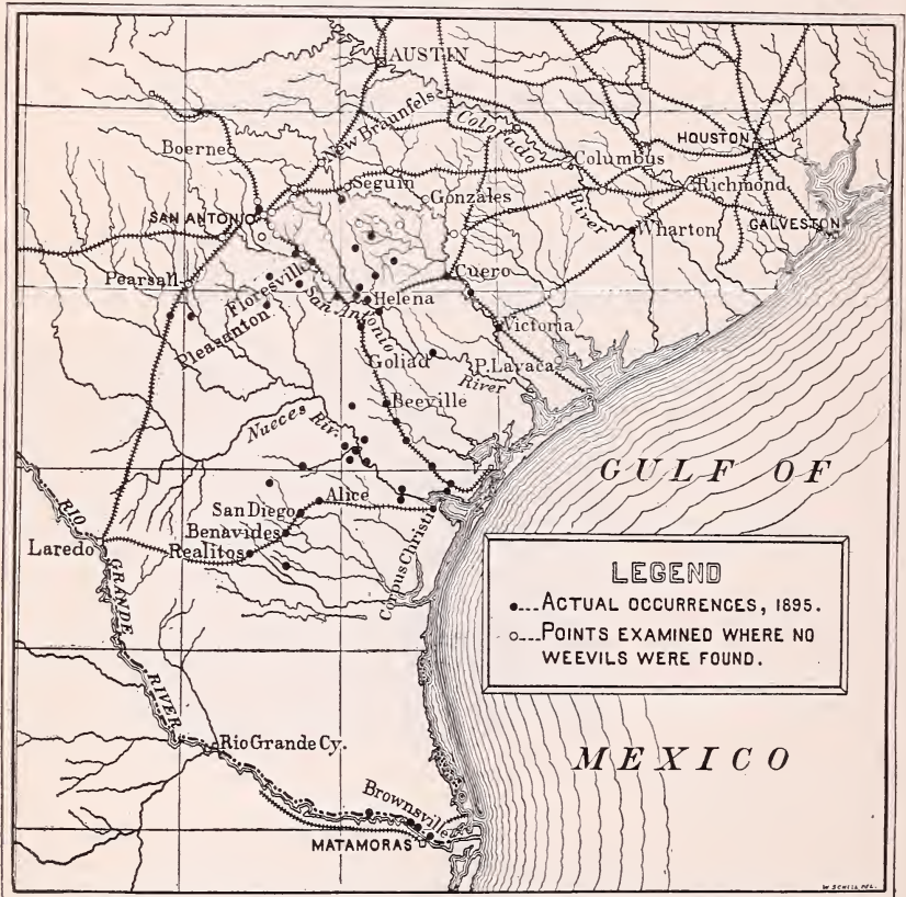
FIG. 2.—Map showing distribution of the Mexican cotton-boll weevil.

This insect through its ravages caused the abandonment of cotton culture around Monclova, Mexico, about 1862. Two or three years ago