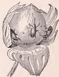
FIG. 5.—Late fall boll showing how beetles hide between boll and involucre.

It was found during the latter part of 1895 that the weevil was present in a number of localities in which it was not known by the planters themselves to occur. It is important that every planter who lives in or near the region which we have mapped out should be able to discover the weevil as soon as it makes its appearance in his fields. Where a field is at all badly infested the absence of bloom is an indication of the presence of the insect. In the early part of the season the weevils attack the squares first, and these wilt and drop off. A field may be in full blossom, and as soon as the insect spreads well through it hardly a blossom will be seen. This dropping alone, however, is not a sufficient indication of the weevil's presence. Squares are shed from other causes, but if a sufficient number of fallen squares are cut open the cause will be apparent. The characteristic larva of the weevil will be quite readily recognizable on comparison with the figures which we publish herewith.