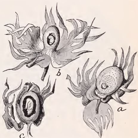
FIG. 3.— a , newly hatched larva in young square; b , nearly full-grown larva in situ ; c , pupa in young boll picked from ground.

With the cutting of the plants or with the rotting or drying of the bolls as a result of frost, the adult weevils leave the plant and seek shelter under rubbish at the surface of the ground, or among weeds and trash at the margin of the fields. Here they remain until the warm days of spring, when they fly to the first buds on such volunteer plants as may come up in the neighborhood. They feed on these and lay their eggs on the early squares, and one, or perhaps two, generations are developed in such situations, the number depending upon the character of the season and the date of cotton planting. By the time the planted cotton has grown high enough to produce squares the weevils have become more numerous, and those which have developed from the generation on volunteer cotton attack the planted cotton, and through their punctures, either for feeding or egg-laying, cause a wholesale shedding of the young squares. It seems to be an almost invariable rule that a square in which a weevil has laid an egg drops to the ground as a result of the work of the larva; in the square on the ground the larva reaches full growth, transforms to pupa, and issues eventually as a beetle, the time occupied in this round approximating four weeks. Later, as the bolls form, the weevils attack them also and lay their