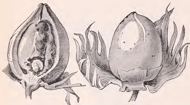
FIG. 4.—Mature boll cut open at left, showing full-grown larva; the one at the right not cut and showing feeding punctures and oviposition marks.

There is a constant succession of generations from early spring until frost, the weevils becoming constantly more numerous and the larvæ and pupæ as well. A single female will occupy herself with egg-laying for a considerable number of days, so that there arises by July an inextricable confusion of generations, and the insect may be found in the field in all stages at the same time. The bolls, as we have just stated, do not drop as do the squares, but gradually become discolored, usually on one side only, and by the time the larva becomes full-grown generally crack open at the tip. While in a square one usually finds but a single larva, in a full-grown boll as many as twelve have been found. In