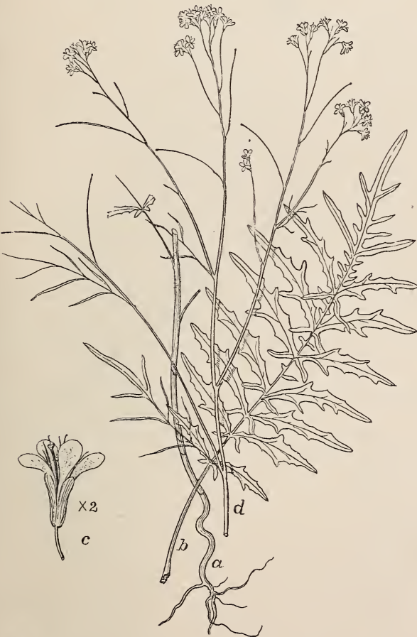
FIG. 1.—Tumbling mustard: a , base of stem of annual plant; b , leaf from lower part of main stem, reduced one-half; c , flower, twice natural size; d , branch with flowers and upper leaves, one-fourth natural size.

The earliest authentic record we have of this species in America is a specimen in the National