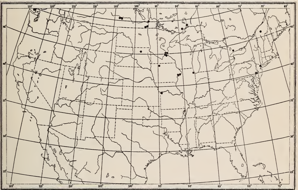
FIG. 3.—Map showing distribution of tumbling mustard so far as known May 25, 1896. (Rogers Pass and Castle Mountain, in Alberta, are beyond the limits of the map.)

The plant is likely to be found along railroads, especially along roads hauling freight from the infested localities. Along these roads it is most