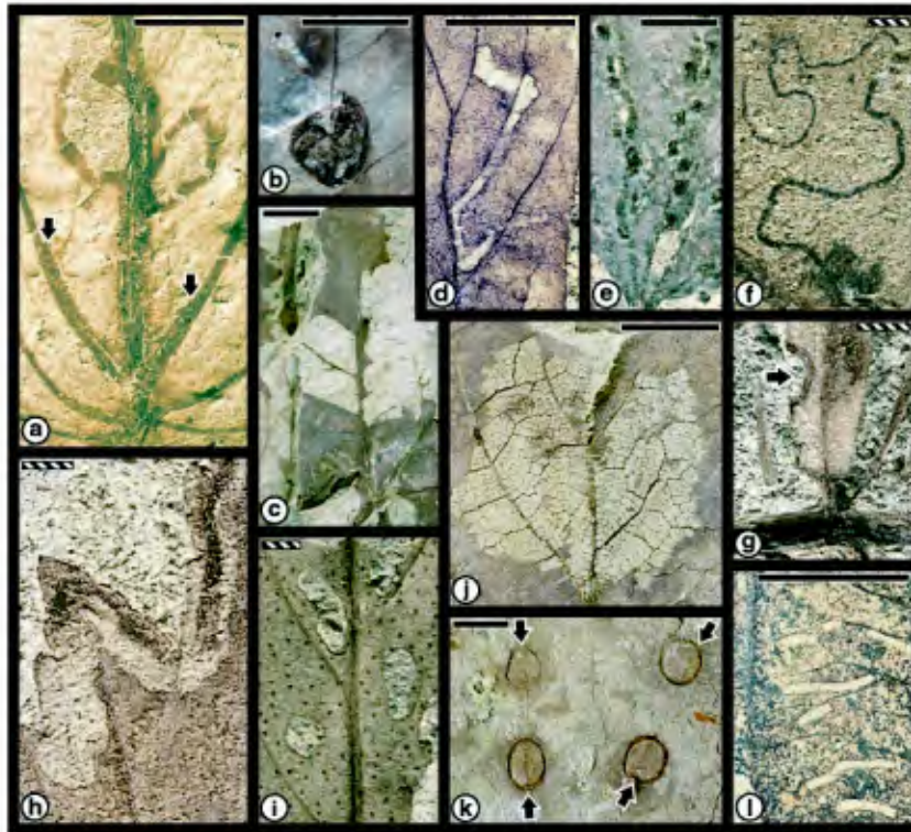
Fig. 1. A spectrum of plant–insect associations from the Williston Basin of southwestern North Dakota. Associations range from the earliest Paleocene at upper left, 14.4 m above the K/T boundary, and continue to the older associations of the latest Cretaceous at lower right, 85.5 m below the boundary. All material is from the Denver Museum of Nature and Science (DMNH) or the Yale Peabody Museum (YPM). Following each plant host are, respectively, morphotype number (indicated by the prefixes HC or FU) (17), specimen number, DMNH locality number (loc.), and \pm meter distances from the K/T boundary as in Fig. 2 (17). Damage types are indicated by the prefix DT (Fig. 2). (Scale bars: solid = 1 cm, backslashed = 0.1 cm.) (a) Two linear mines with oviposition sites (arrows), following secondary and then primary venation, terminating in a large pupation chamber (DT59), on the dicot Paranymphaea crassifolia (FU1), DMNH 20055, loc. 563, +14.4 m. (b) Single gall (DT33) on primary vein of Cercidiphyllum genatrix (Cercidiphyllaceae, FU5), DMNH 20042, loc. 562, +8.4 m. (c) Free feeding (DT26) on Platanus raynoldsii (Platanaceae, FU16), DMNH 20035, loc. 2217, +1.3 m. (d) Skeletonization (DT61) on a probable lauralean leaf (HC32), DMNH 19984, loc. 2097, –31.4 m. (e) Multiple galls (DT33) on Trochodendroides nebrascensis (Cercidiphyllaceae, HC103), DMNH 19976, loc. 1489, –33.7 m. (f) Initial phase of a serpentine mine (DT45) on Marmarthia pearsonii (Lauraceae, HC162), DMNH 7228, loc. 2087, –36.9 m. (g) Cusped margin feeding (DT12, arrow) on Metasequoia sp. (Cupressaceae, HC35), DMNH 13108, loc. 567, –56.8 m. (h) Serpentine leaf mine (DT43) assigned to the Nepticulidae (Lepidoptera), on unidentified Rosaceae (HC80), YPM 6367a, loc. 567, –56.8 m. (i) Hole feeding pattern (DT57) on an unknown genus of Urticales (HC81), DMNH 19539, loc. 2203, –56.8 m. (j) General skeletonization (DT16) on Erlingdorffia montana (Platanaceae, HC57), DMNH 11013, loc. 571, –61.7 m. (k) Large scale-insect impressions (DT53) centered on primary veins of E. montana , DMNH 18829b, loc. 571, –61.7 m. (l) Slot hole feeding (DT8) on an unidentified genus of Platanaceae (HC109), DMNH 18658, loc. 434, –88.5 m. See Table 1, which is published as supporting information on the PNAS web site, for additional descriptions of damage types.

Each specimen was inspected for insect-mediated damage, which when present, was assigned to one or more of 51 insect damage types (Figs. 1 and 2). Herbivory was recognized on the basis of four explicit criteria, which were used singly or in combination. These criteria were: the presence of reaction tissue; anatomic details of the cut margin, such as excision cusps made by mandibles; stereotypy based on pattern, position, or size and shape of the damage; and plant–host specificity (24, 33). Each damage type then was classified into one of four functional feeding groups: external foliage feeding, subdivided into margin feeding, hole feeding, skeletonization, and special types of external feeding damage; galling; mining; and piercing and sucking; as well as a separate, nonfeeding damage type for oviposition. Additionally, we assigned each damage type to one of three categories based on the degree of plant–host specificity typically but not exclusively found in various insect species producing the same damage type today (24): generalized for polyphagy, intermediate for oligophagy, and specialized for monophagy. We note that some occurrences of damage types within our generalized category undoubtedly represent feeding by specialist as well as generalist insects, thus biasing toward a conservative estimate for specialist extinction. Host specificity assignments were based on published surveys of modern plant