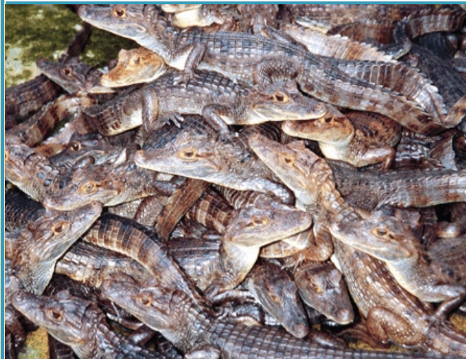
Juvenile Crocodylus acutus / Lagartos blancos juveniles.