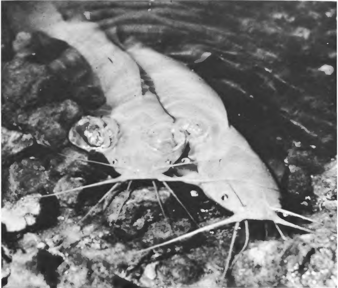
FIGURE 2.—Albino walking catfish, Clarias batrachus , an Asian import, surface at edge of pond in Brevard County, Florida.

move considerable distances overland, especially on damp or rainy nights and easily occupy new water systems. In its voracious food habits it competes with, and in time may deplete, the native food and game fishes, particularly the centrarchids, of the warm southeastern freshwaters with which it competes directly for food. Small natural ponds from which the walking catfish has been seined in Florida, produced up to 3000 pounds of this species per acre. There is no current American market for its flesh. Certainly, the food fishes it replaces are far more palatable. This species is a severely harmful competitor, for it apparently reduces