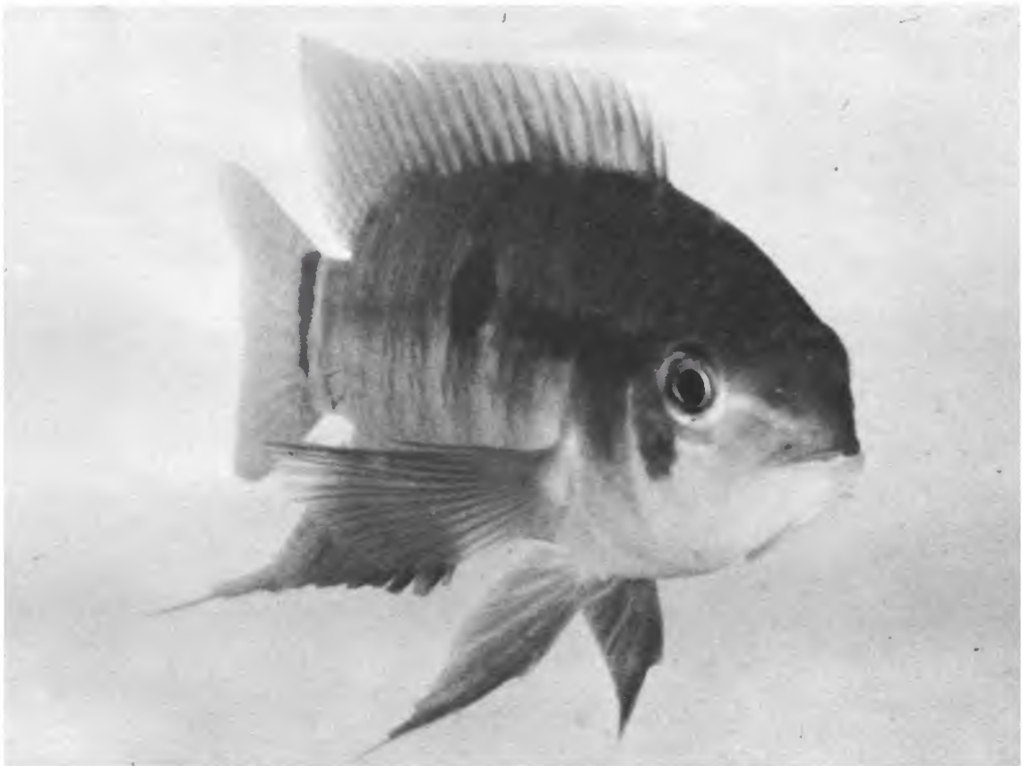
FIGURE 3.— Upper : the Mozambique mouthbrooder, Tilapia mossambica , native to Africa, has been widely distributed in North America. This specimen was taken from the brackish waters about Hypoluxo Isle, Palm Beach County, Florida.

Lower : the black acara, or port cichlid, Aequidens portalegrensis , a South American species, is well established in south Florida canals and waterways. This species appears to thrive in Florida waters occupied by the walking catfish.