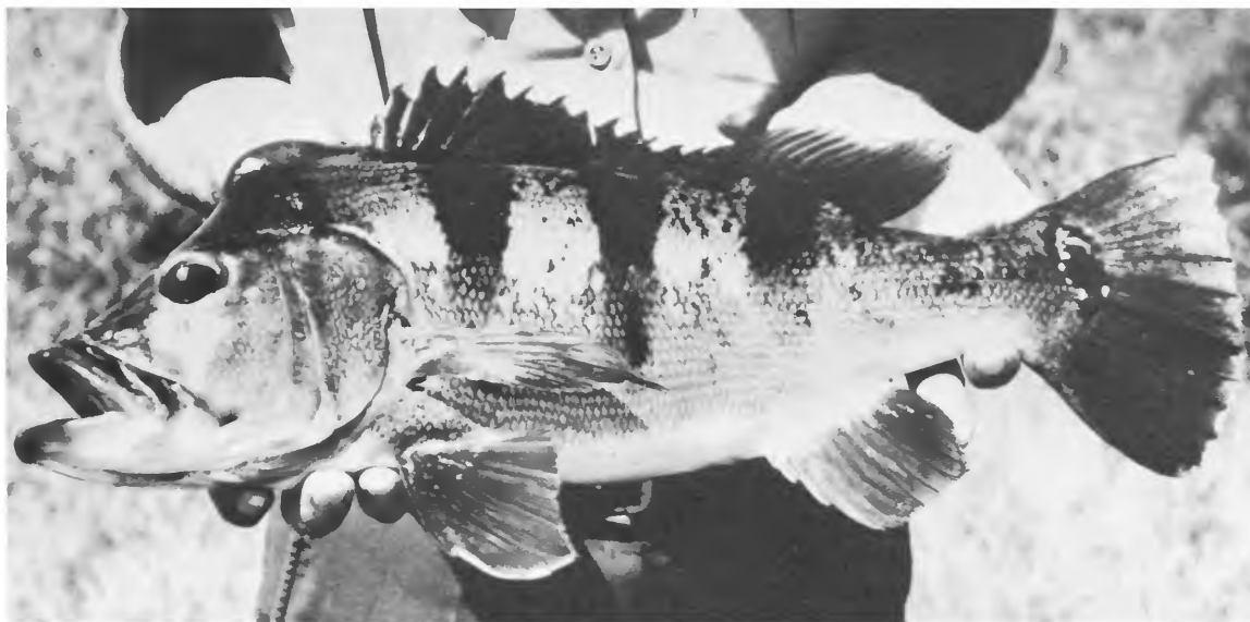
FIGURE 4.—The peacock cichlid, or tucanare, native to South America, attains large sizes. Many juveniles were released in waters of Dade County, Florida in 1964.

Two Asian gobies are well established in the Stockton area, California. The yellowfin goby, Acanthogobius flavimanus , native to the estuarine waters of Japan, Korea, and eastern China, was first reported in the San Joaquin Delta by Brittan, Albrecht, and Hopkirk