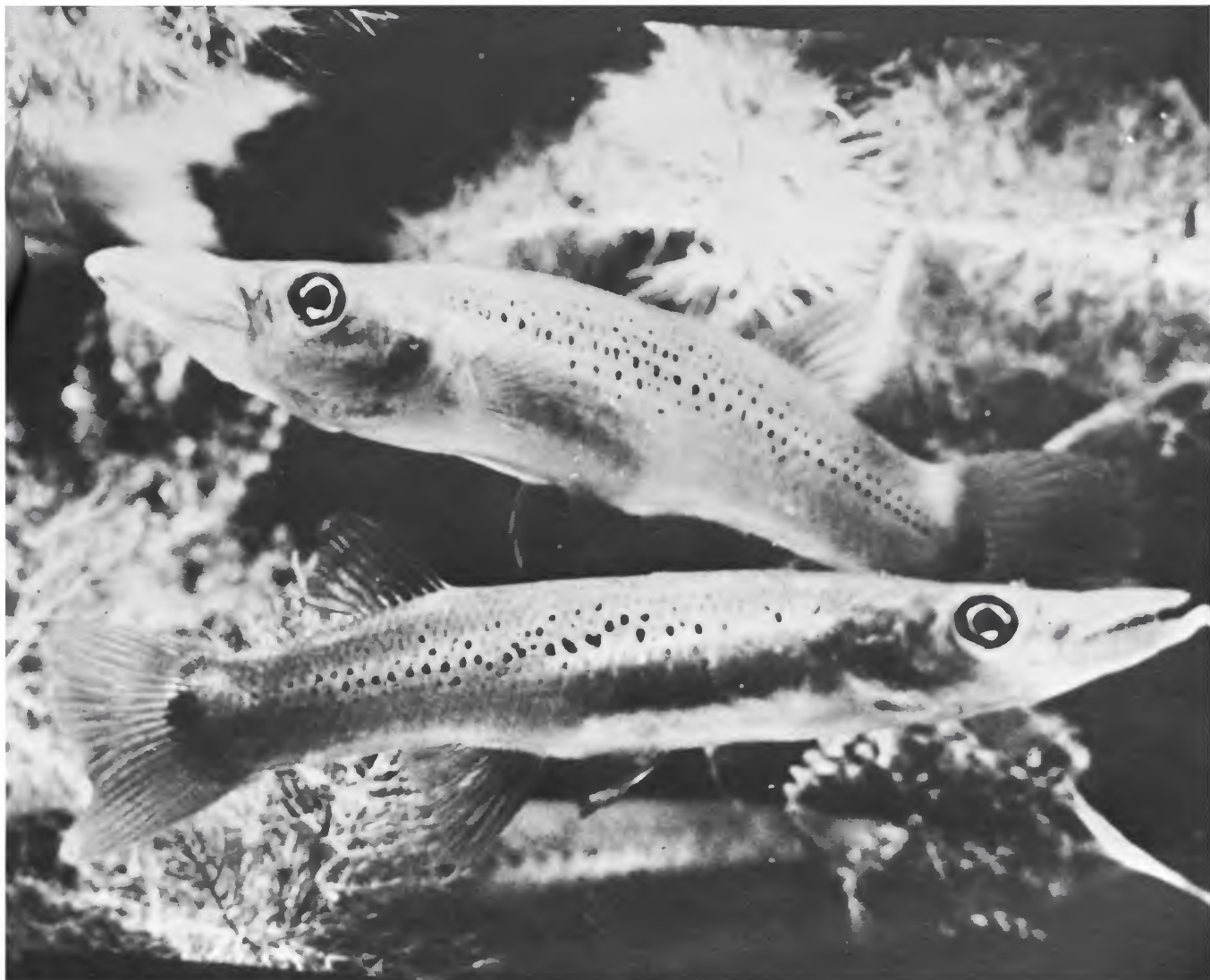
FIGURE 1.—The pike killfish, Belonesox belizanus , an import from Yucatan, is well established in waters of south Dade County, Florida. This live bearer, although reaching a length of 8 to 9 inches, is an active, predaceous carnivore on small aquatic life.