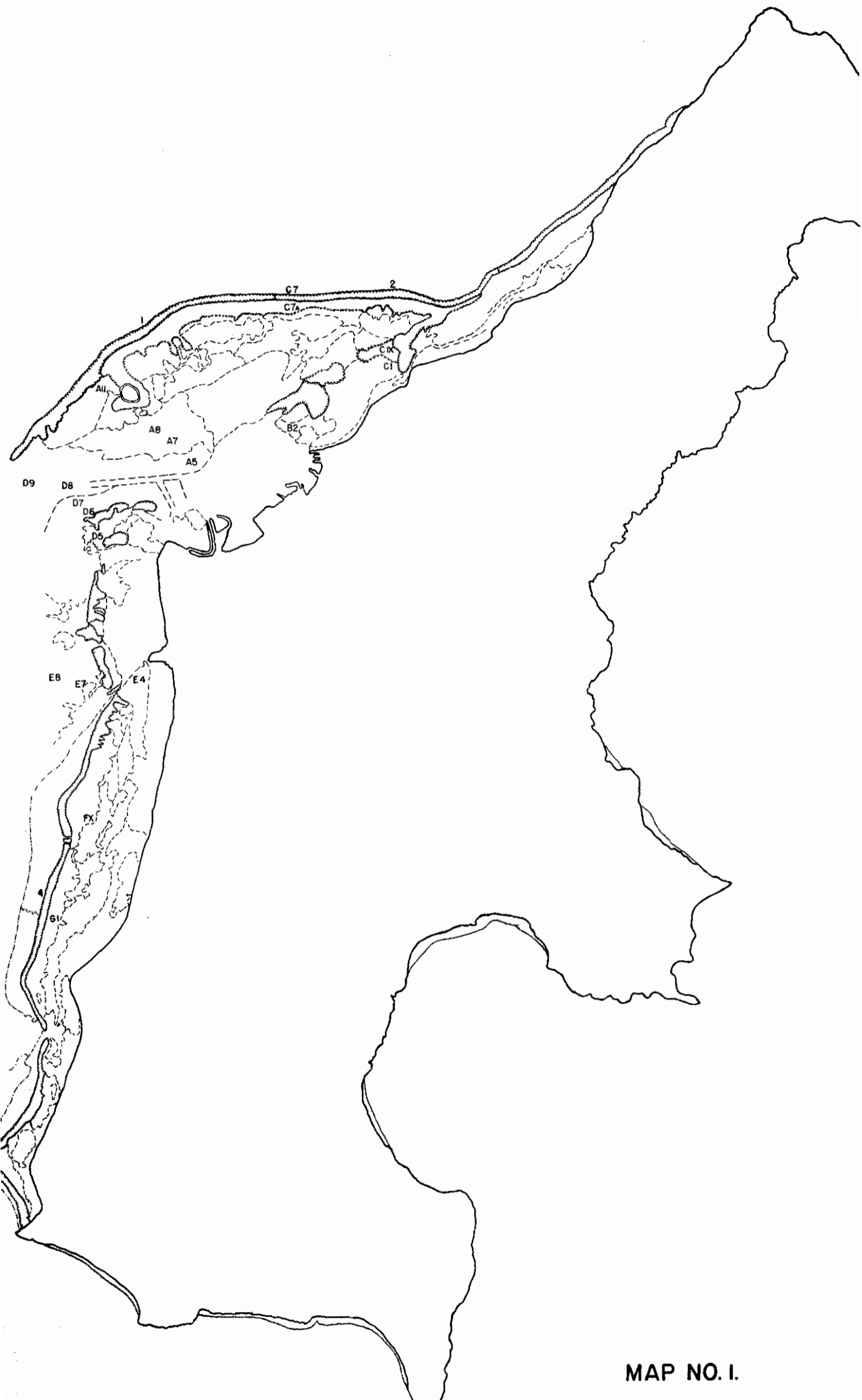
MAP NO. I.