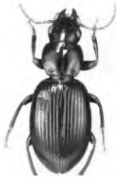
Hawaiian carabid beetle.

Images and data from the mission will be readily available on the Internet and on display in the National Air and Space Museum's Exploring the Planets gallery.