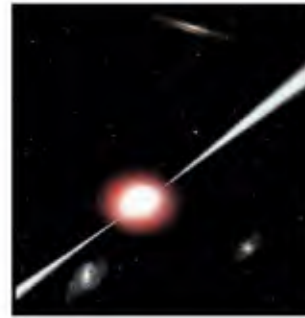
Artist's conception of the violent gamma ray bursts.

served, habitats suggests that other long-missing koa flora and fauna may persist in similar situations on Haleakala. The authors have concluded that while the dry and mesic forests may be greatly reduced in Hawaii, their distinctive and diverse animal and plant life still lingers. Their findings were recently published in Pacific Science and Environment Hawaii .