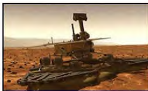
Artist's conception of one of the Mars Exploration rovers on Mars.

The complete reversal of the floral patterns between St. Lucia and Dominica, together with an increase in the length and curvature of flowers of the red H. caribaea morph to match the bills of females, support the hypothesis that feeding preferences have driven their co-adaptation.