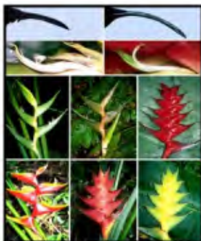
Heliconia caribaea and H. bihai forms studied in Dominica and St. Lucia and the Hummingbird ( Eulampis jugularis ) male and female bills.